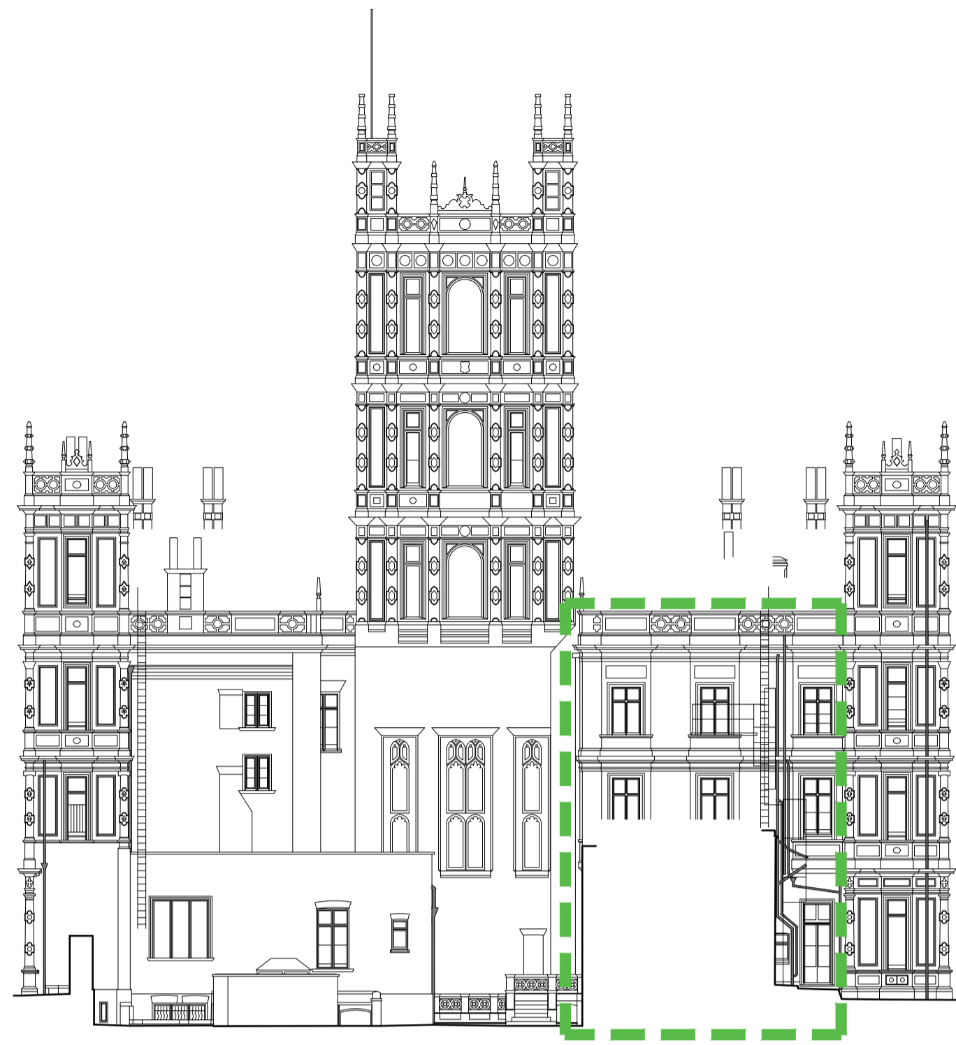
Key Elevation (West) Scale 1:200