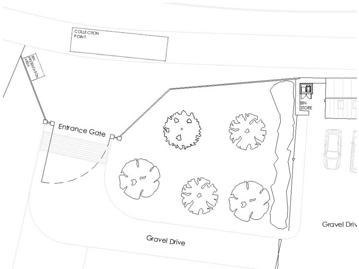
Fig 1 – Showing Bin presentation area & Vehicle collection point