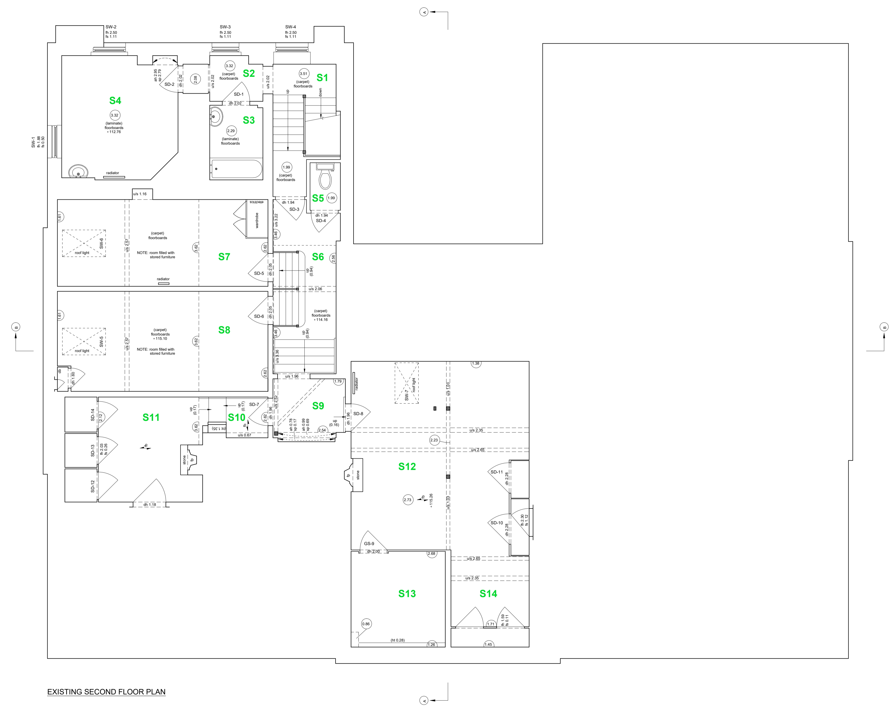
EXISTING SECOND FLOOR PLAN