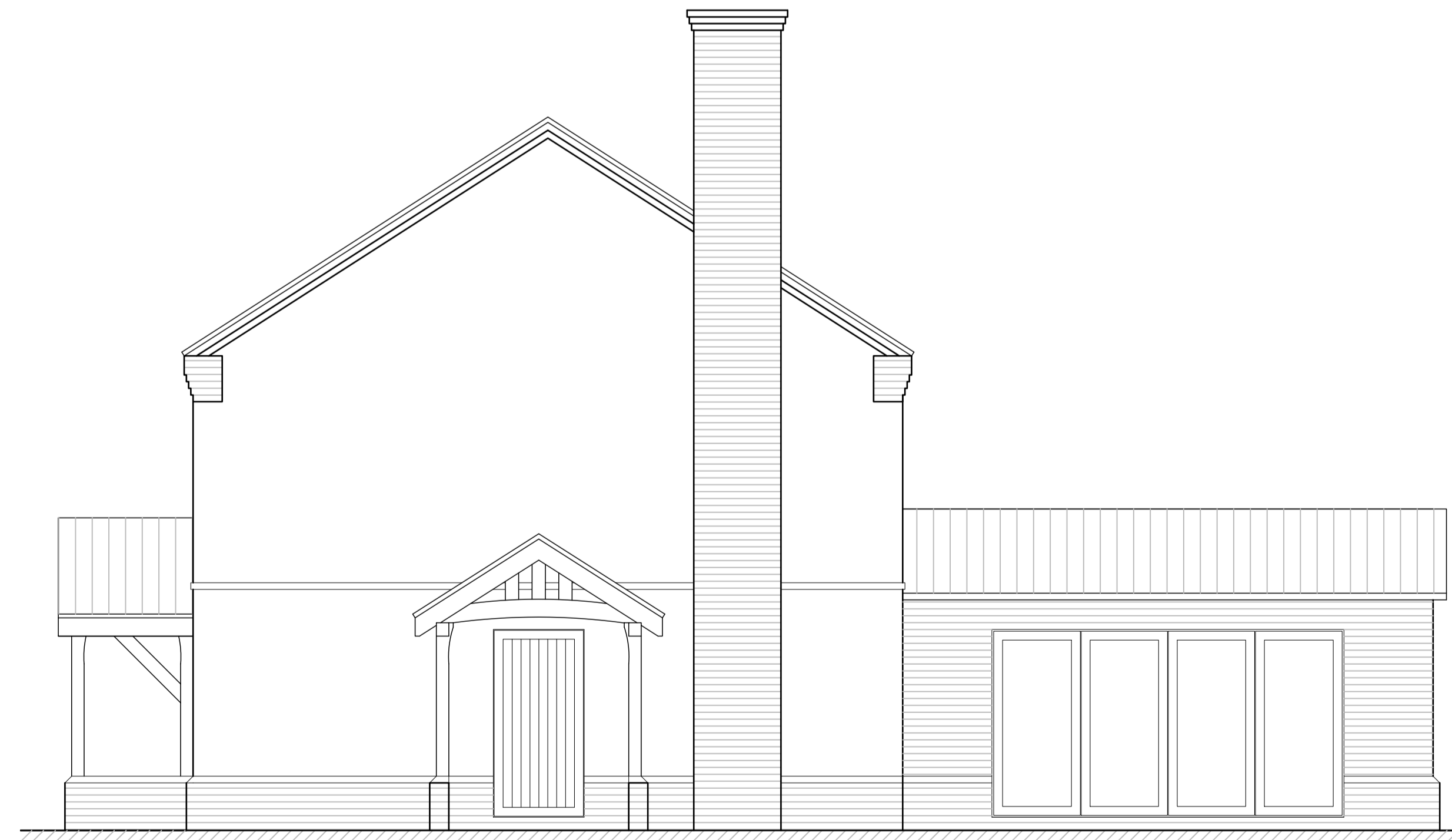
Proposed Side Elevation Scale: 1:50