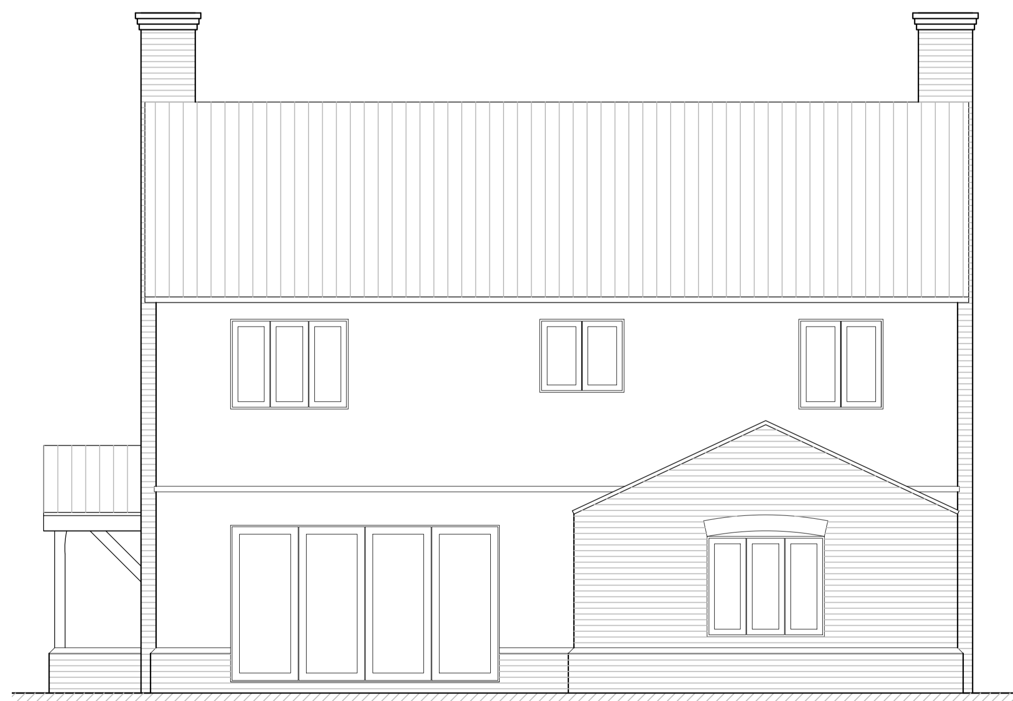
Proposed Rear Elevation Scale: 1:50