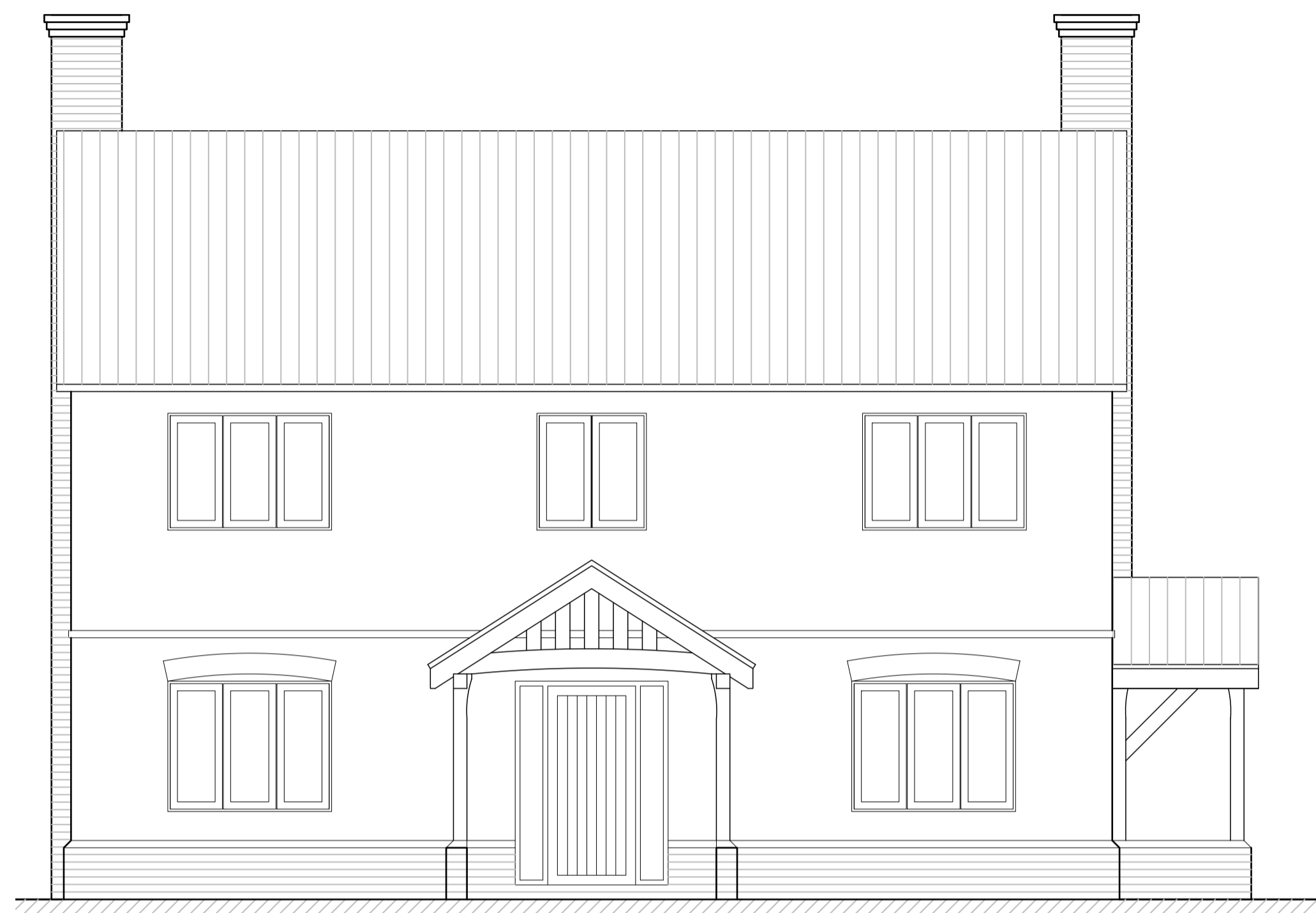
Proposed Front Elevation Scale: 1:50