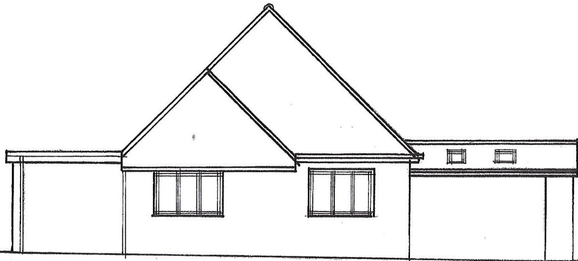
EXISTING FRONT ELEVATION (NORTH)