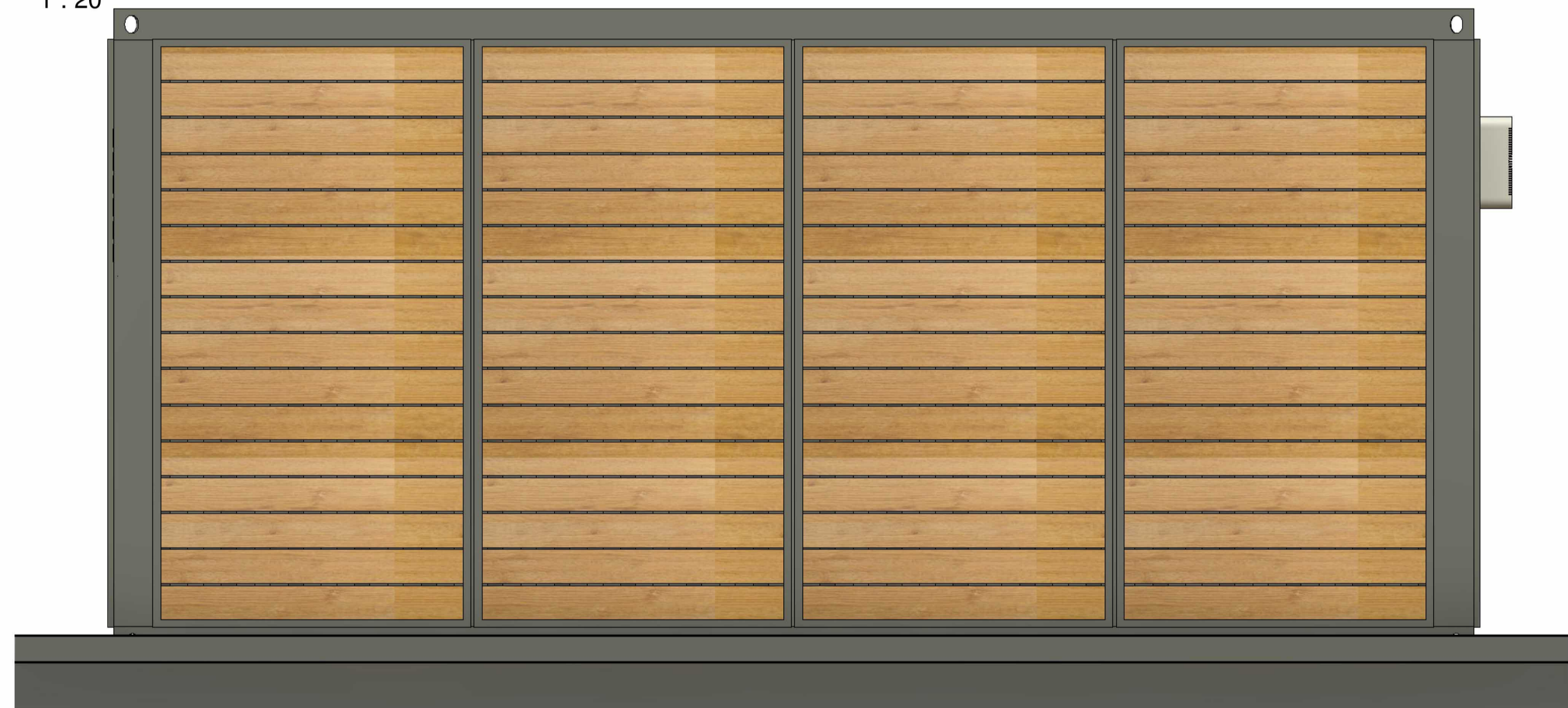
RIGHT HAND ELEVATION