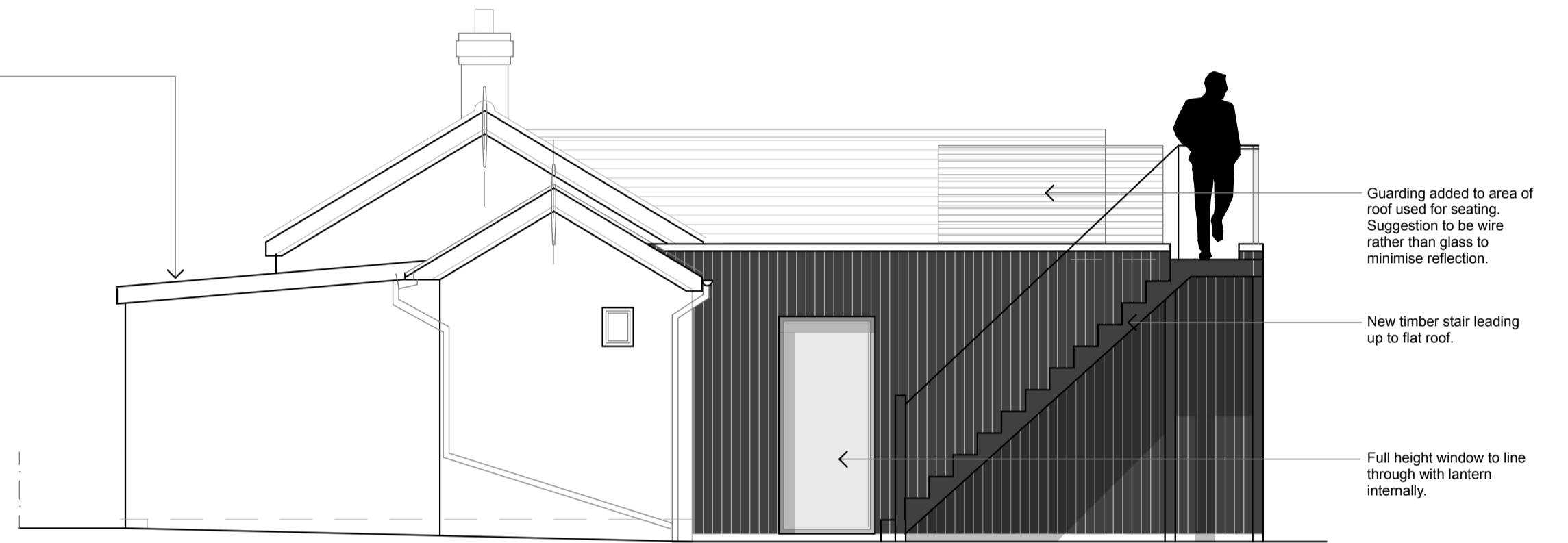
North East Elevation 1:50