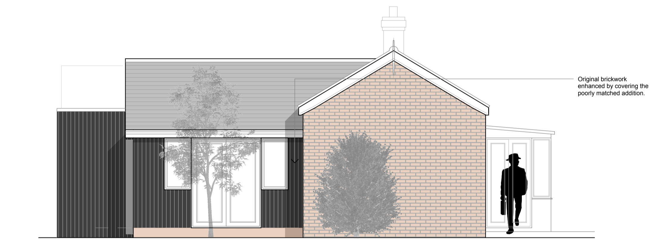
South West Elevation 1:50