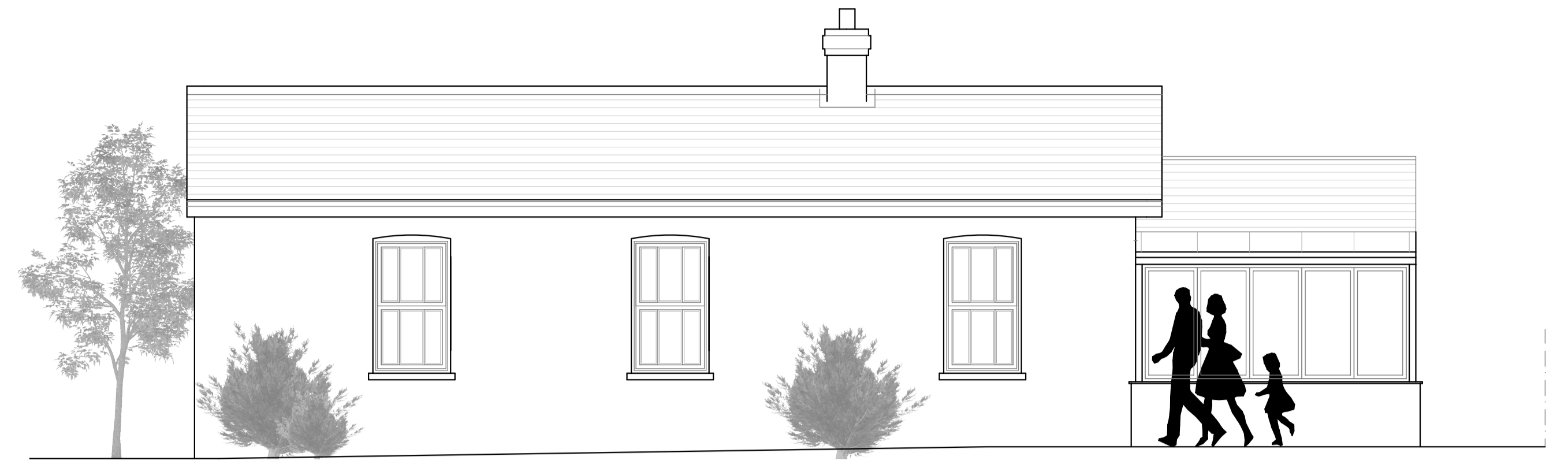
South East Elevation 1:50