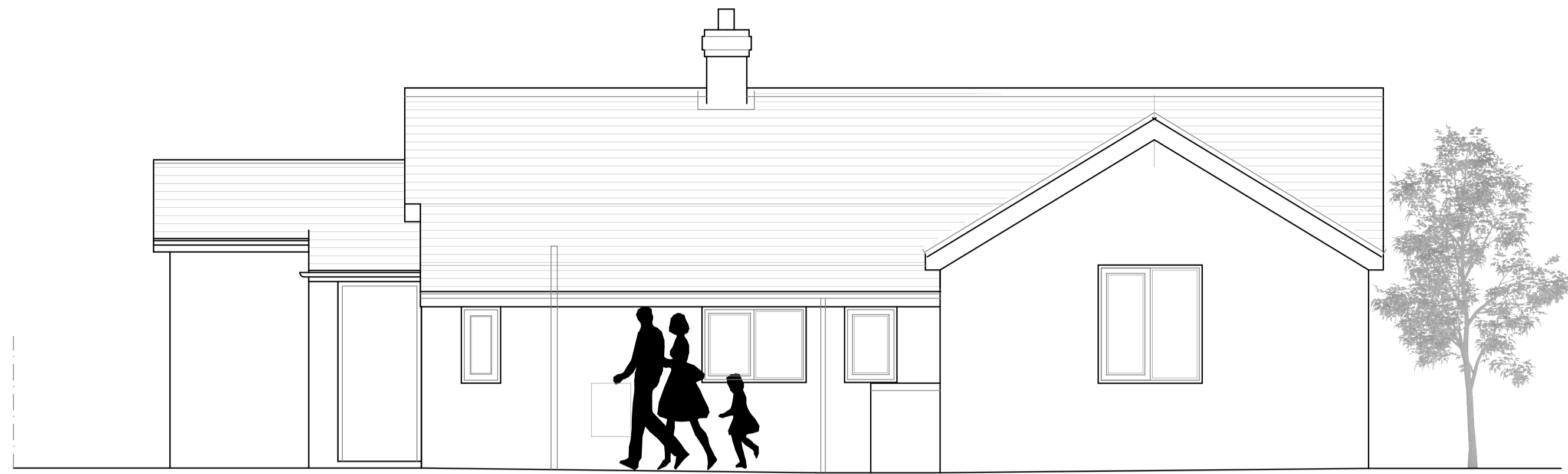
North West Elevation 1:50