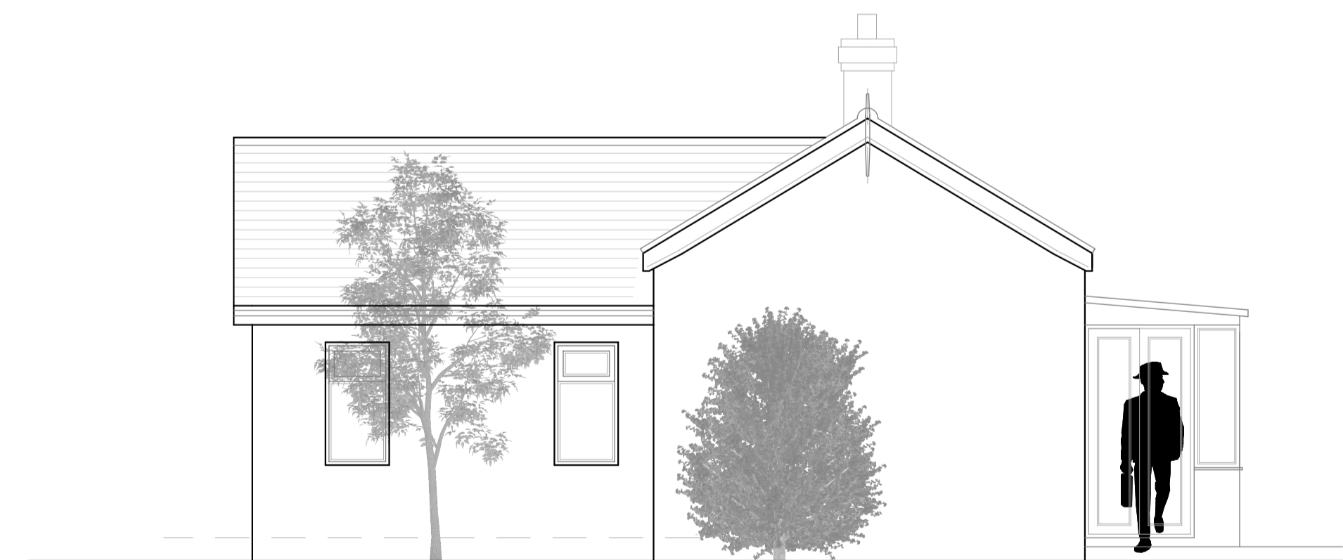
South West Elevation 1:50