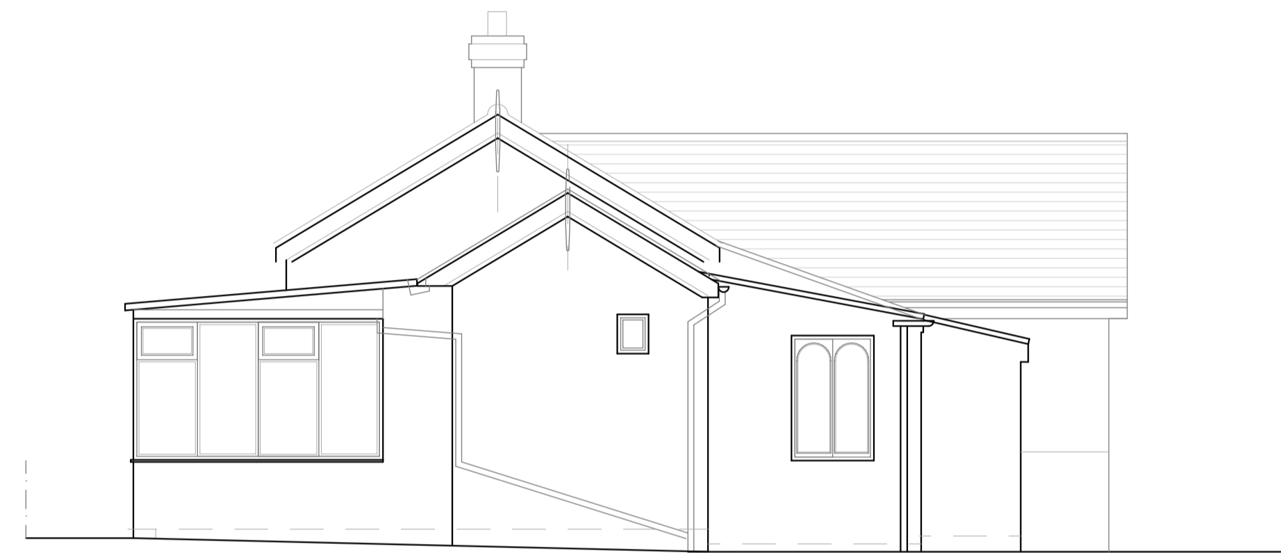
North East Elevation 1:50