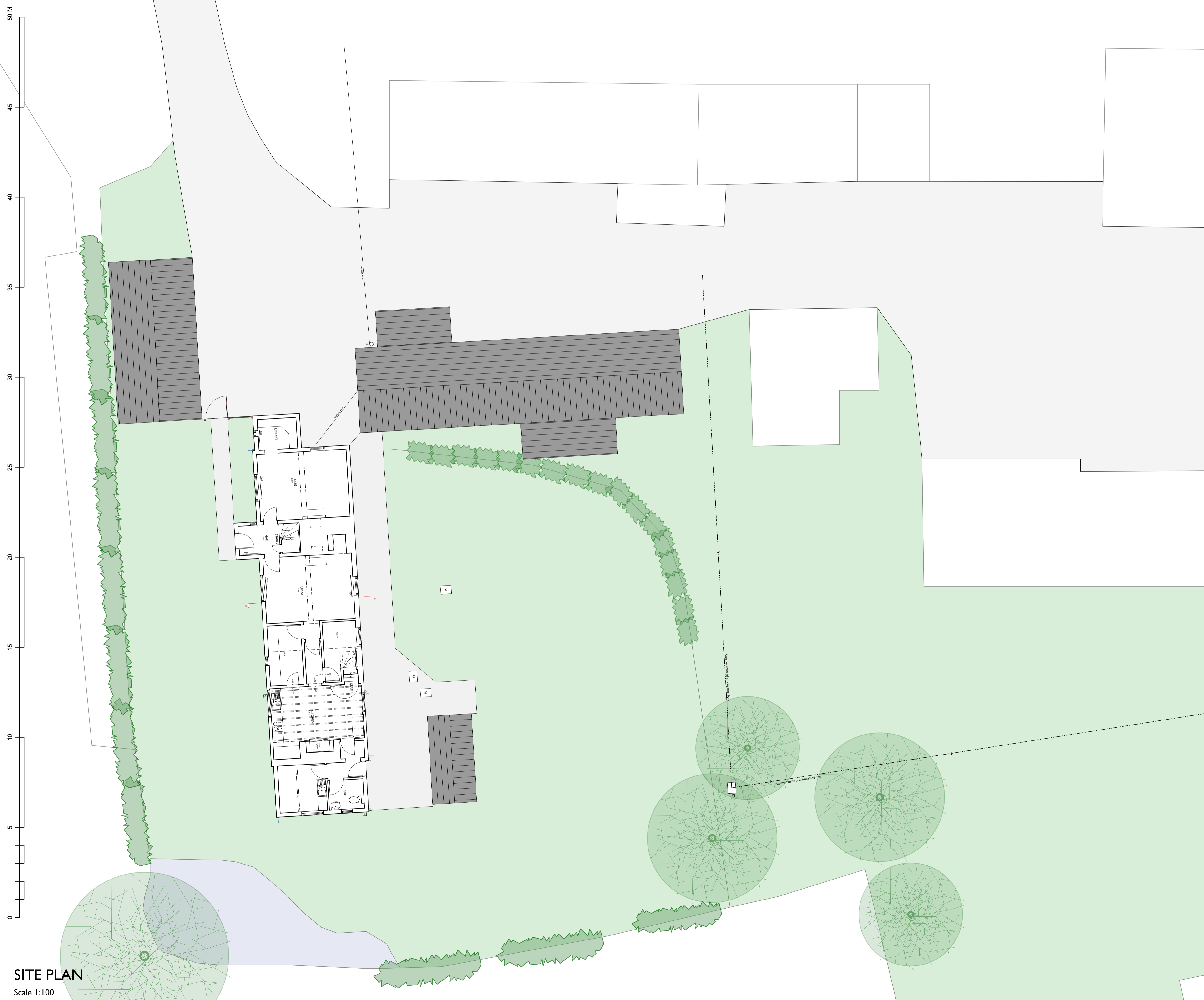
SITE PLAN Scale 1:100

General Notes 1. Do not scale this drawing. All dimensions to be as noted. Contractor to check all dimensions on site before carry out works. 2. This drawing is for the private and confidential use of the client for whom it was undertaken and it should not be reproduced in whole or in part or relied upon by third parties for any use without the express written authority of Beech Architects Limited.