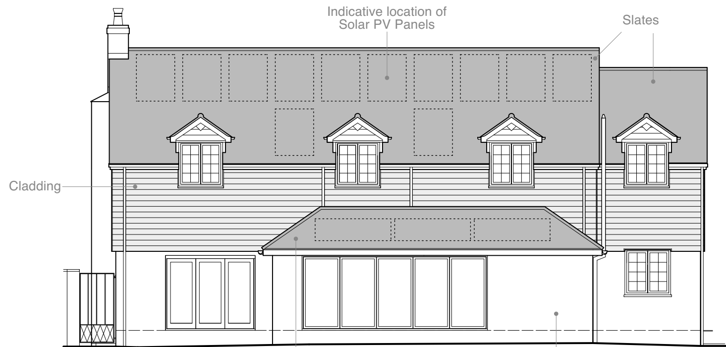
3 South Elevation 03 Scale: 1:100