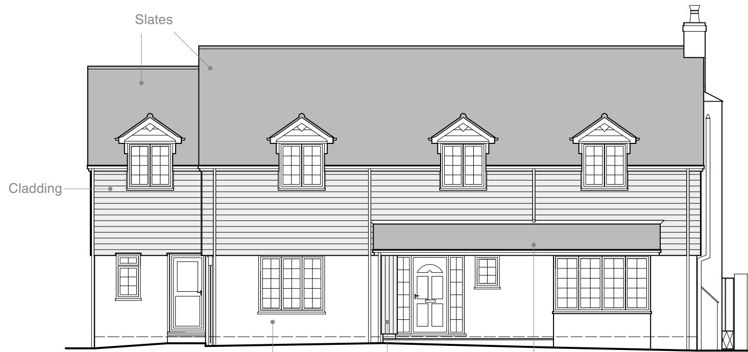
1 North Elevation 03 Scale: 1:100