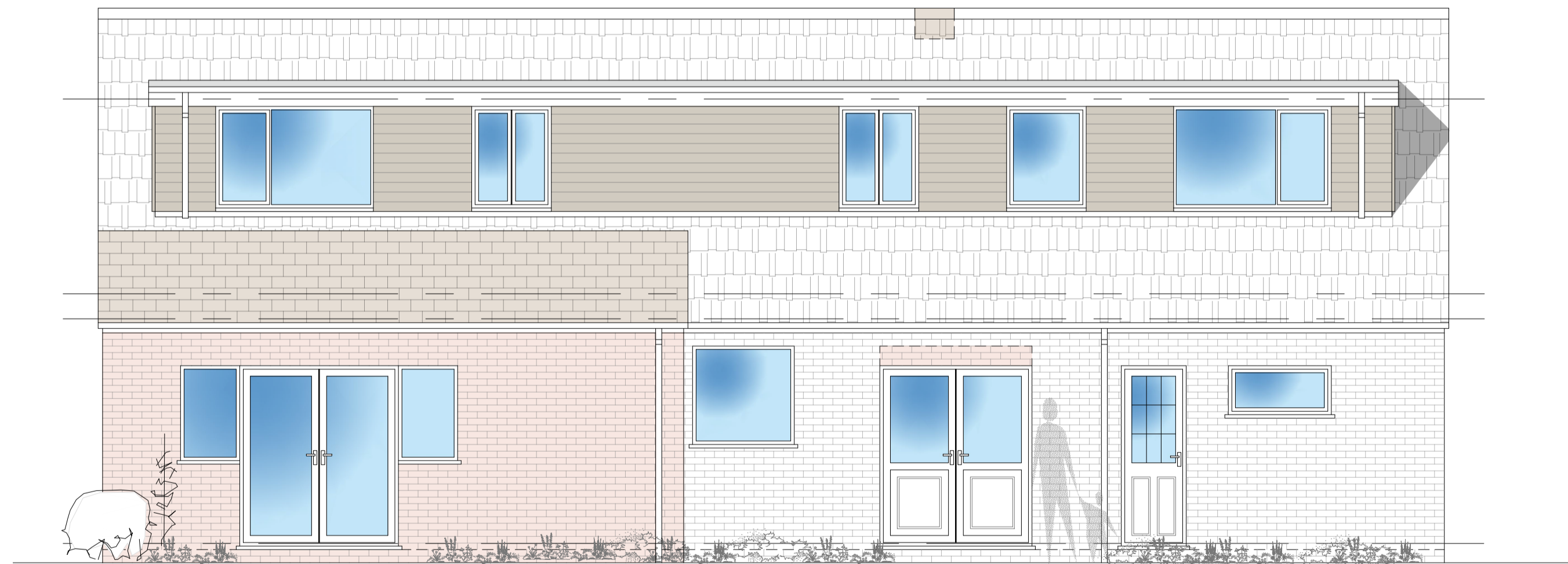
3 REAR ELEVATION PROPOSED Scale 1:50