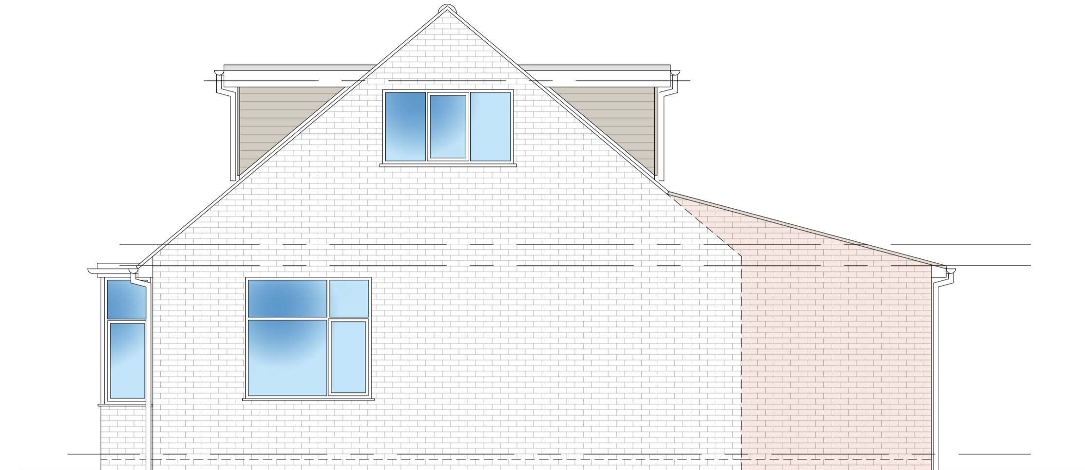
2 SIDE ELEVATION PROPOSED Scale 1:50