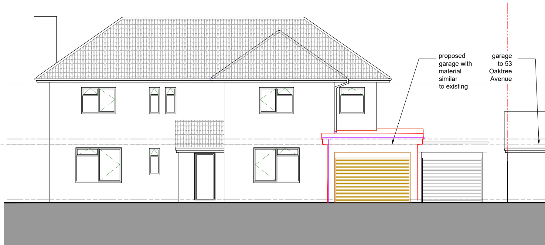
15 Proposed Front Elevation (South) S scale 1:100

NOTES. THIS DRAWING IS COPYRIGHT. THE DRAWING IS NOT TO BE USED FOR CONSTRUCTION UNLESS MARKED 'FOR CONSTRUCTION' THE CONTRACTOR IS RESPONSIBLE FOR ALL DIMENSIONS AND THE CORRECT SETTING OUT ON SITE. ONLY FIGURED DIMENSIONS ARE TO BE USED, IF IN DOUBT ASK. ALL MATERIALS AND WORKMANSHIP TO COMPLY WITH THE CURRENT BRITISH STANDARDS AND CODES OF PRACTICE.