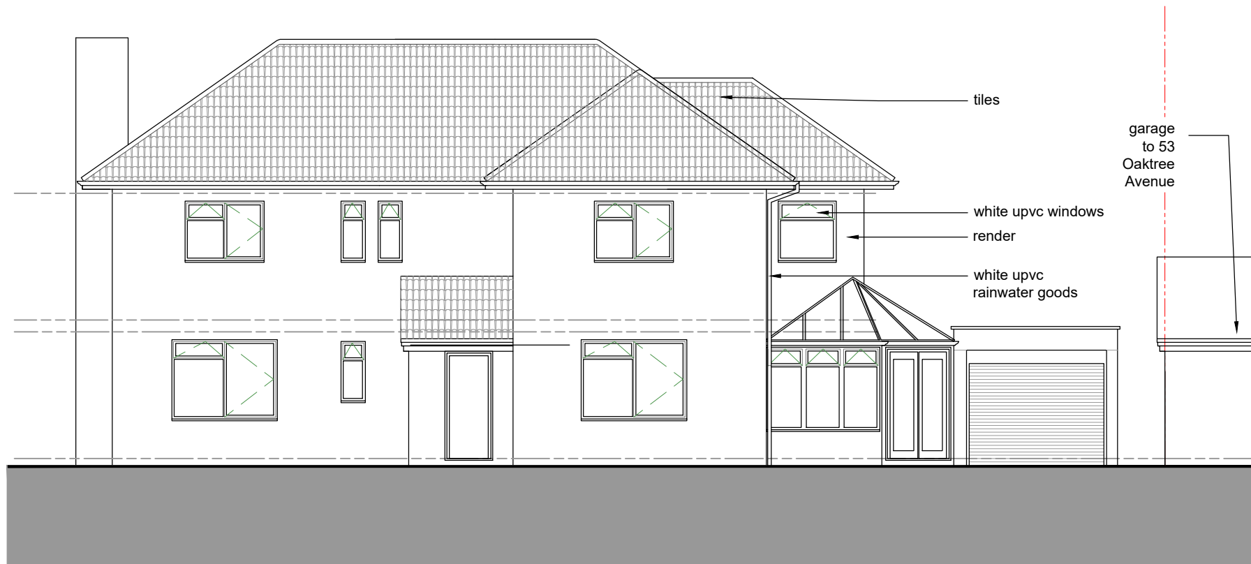
05 Existing Front Elevation (South) S scale 1:100