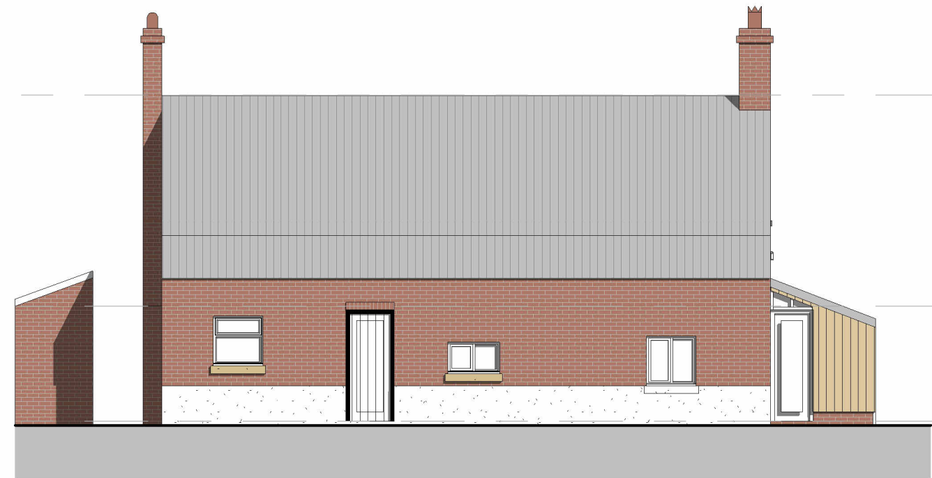
Rear Elevation - Existing