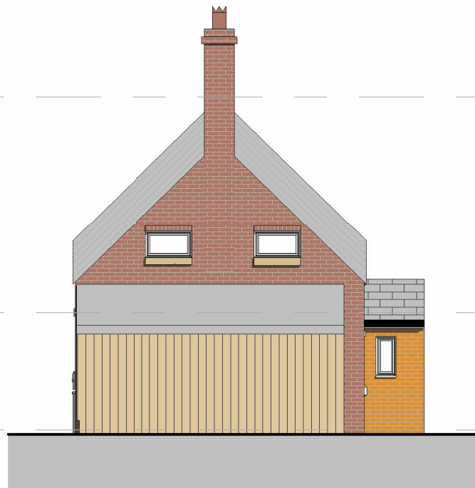
Left Side Elevation - Existing

02 - Roof 6183 01 - First Floor 2180 00 - Ground Floor 0