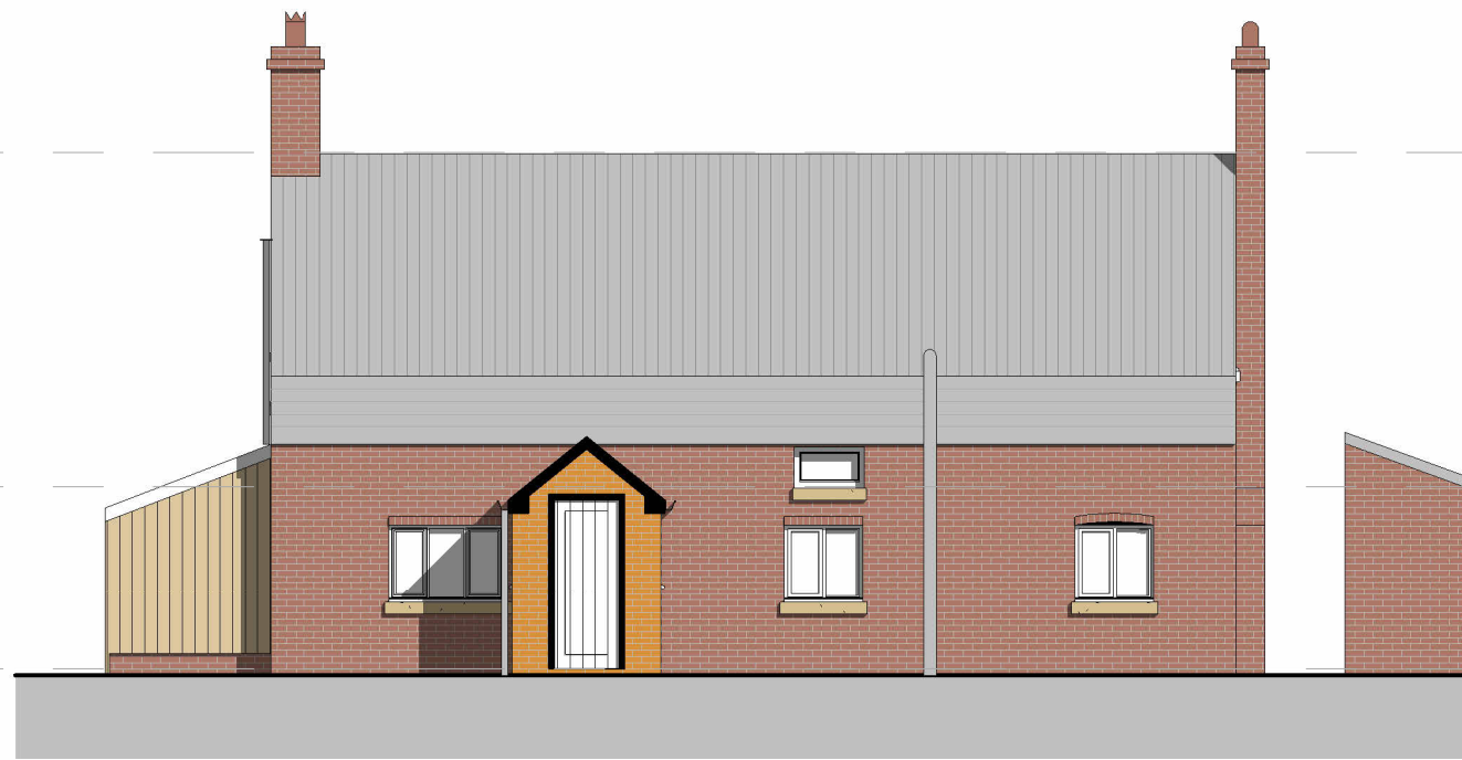
Front Elevation - Existing

02 - Roof 6183 01 - First Floor 2180 00 - Ground Floor 0