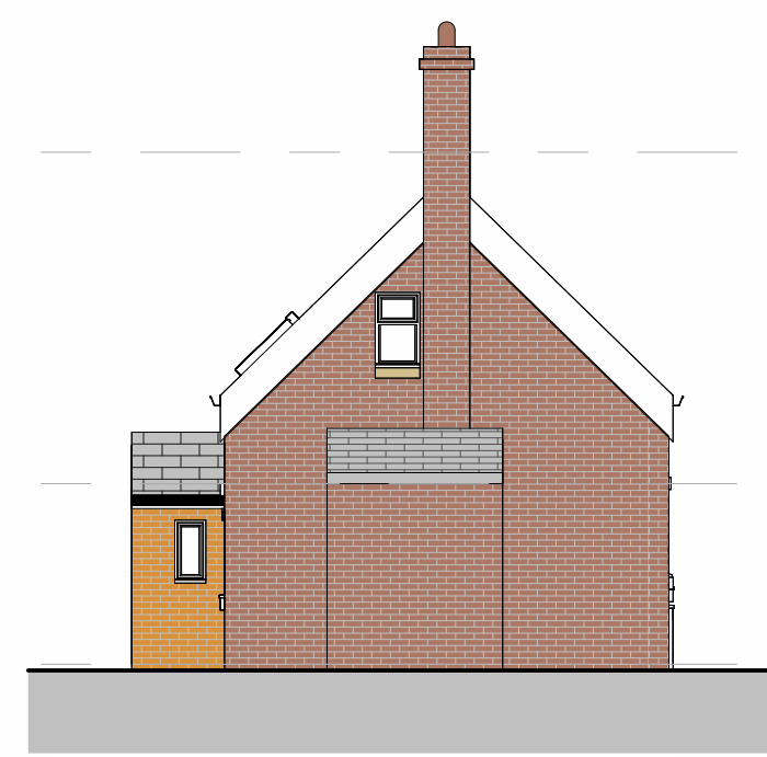
Right Side Elevation - Proposed

02 - Roof 6183 01 - First Floor 2180 00 - Ground Floor 0