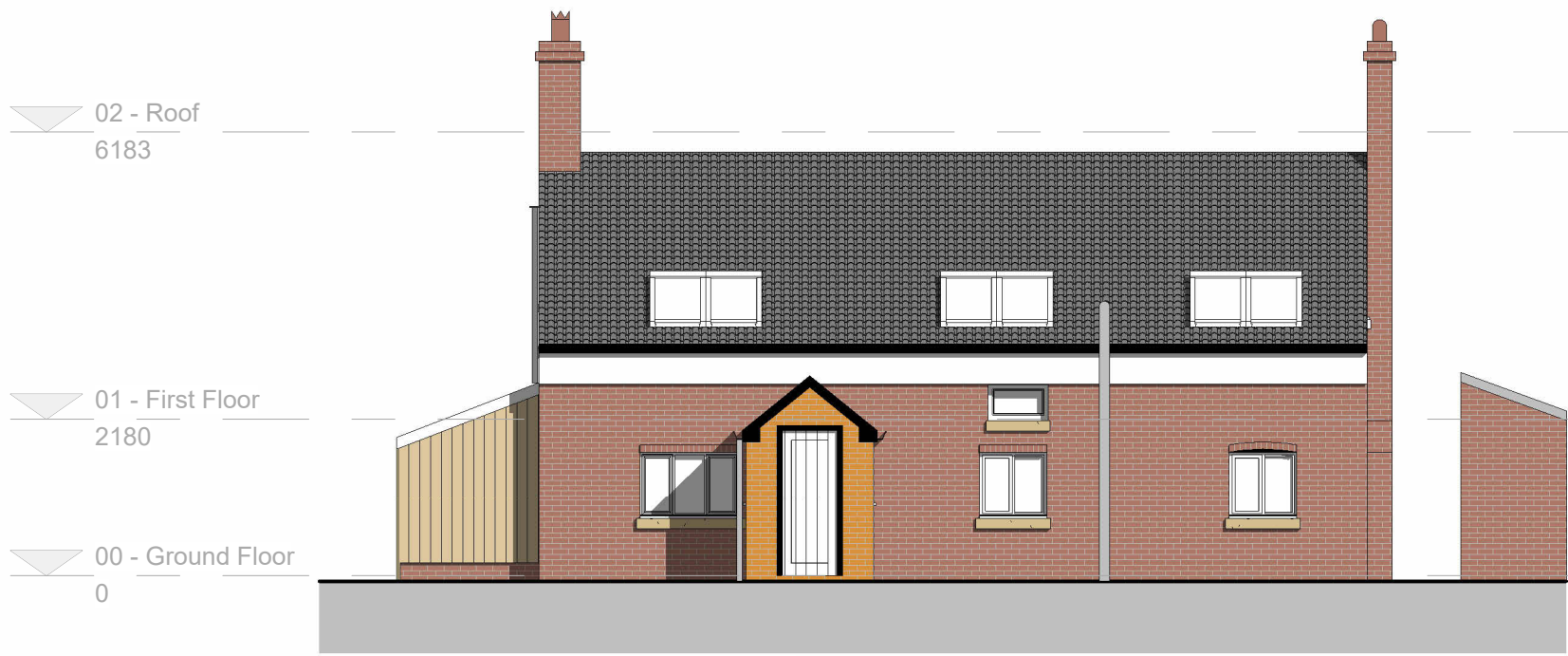
Front Elevation - Proposed

02 - Roof 6183 01 - First Floor 2180 00 - Ground Floor 0