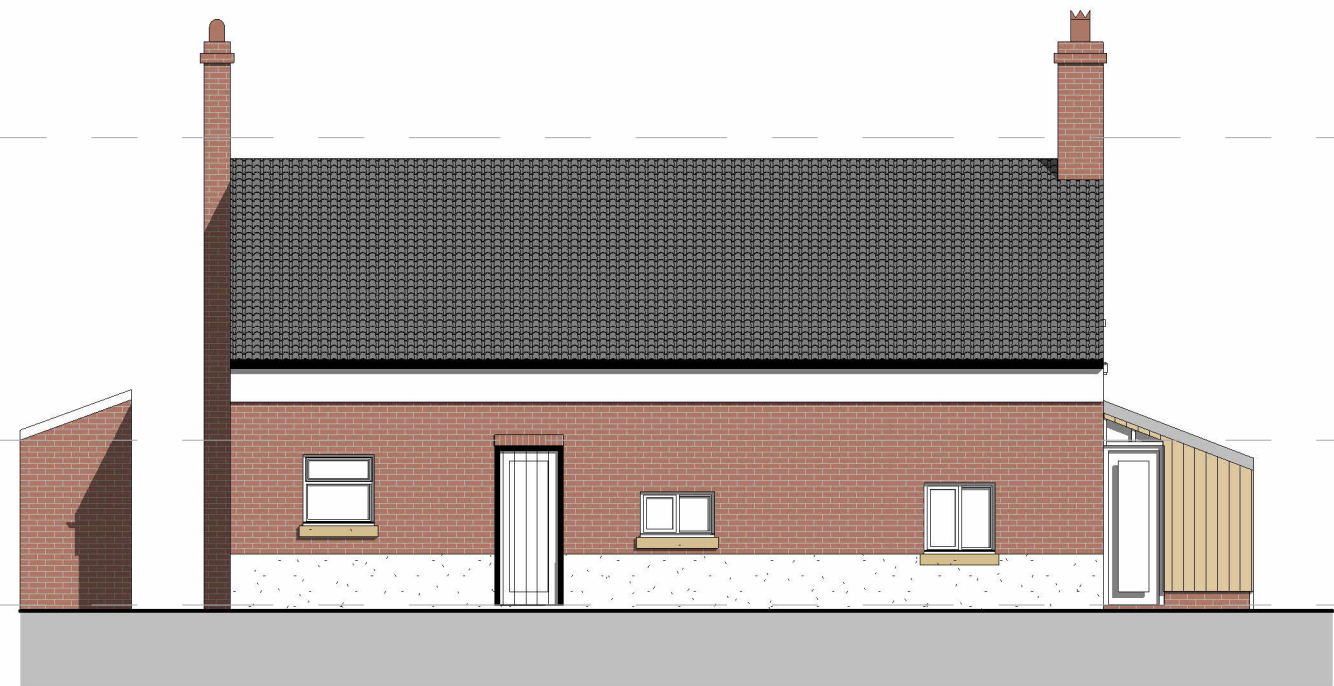
Rear Elevation - Proposed

02 - Roof 6183 01 - First Floor 2180 00 - Ground Floor 0