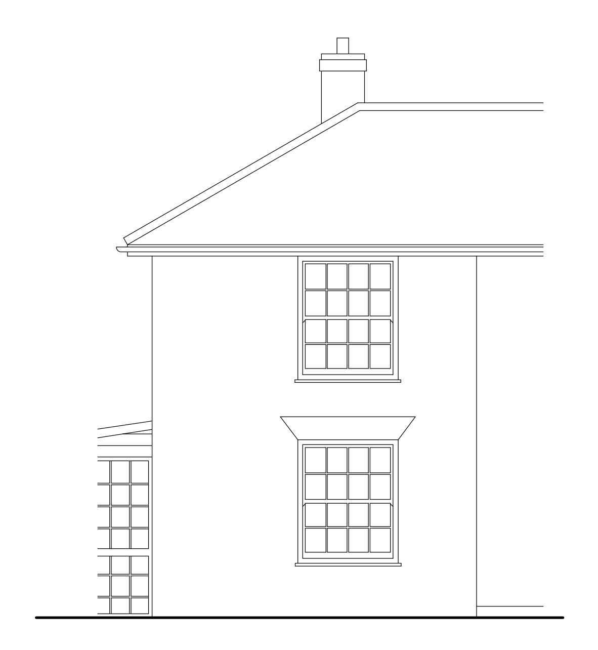
EXISTING FRONT (SOUTH) ELEVATION. (1:50)