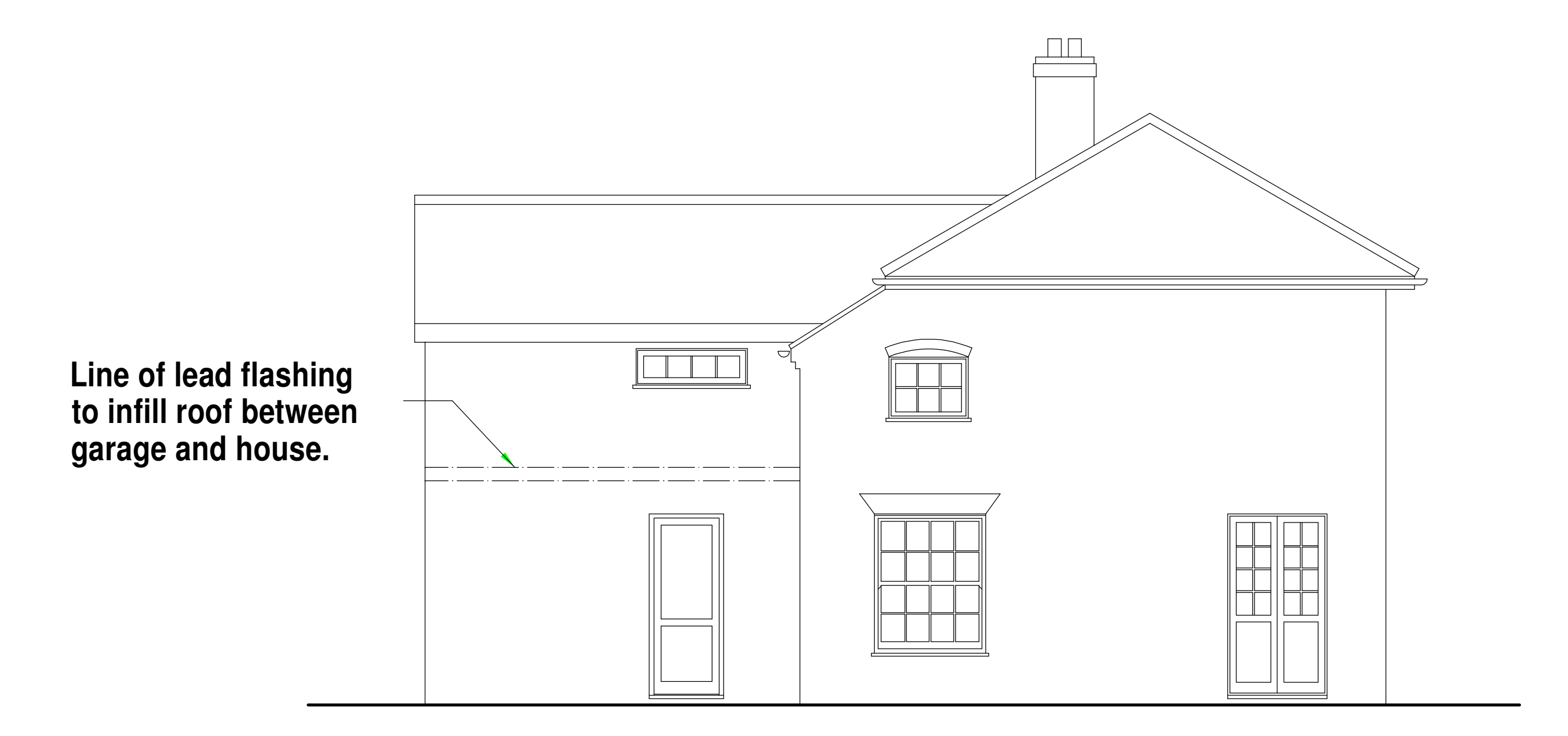
EXISTING SIDE (WEST) ELEVATION. (1:50)