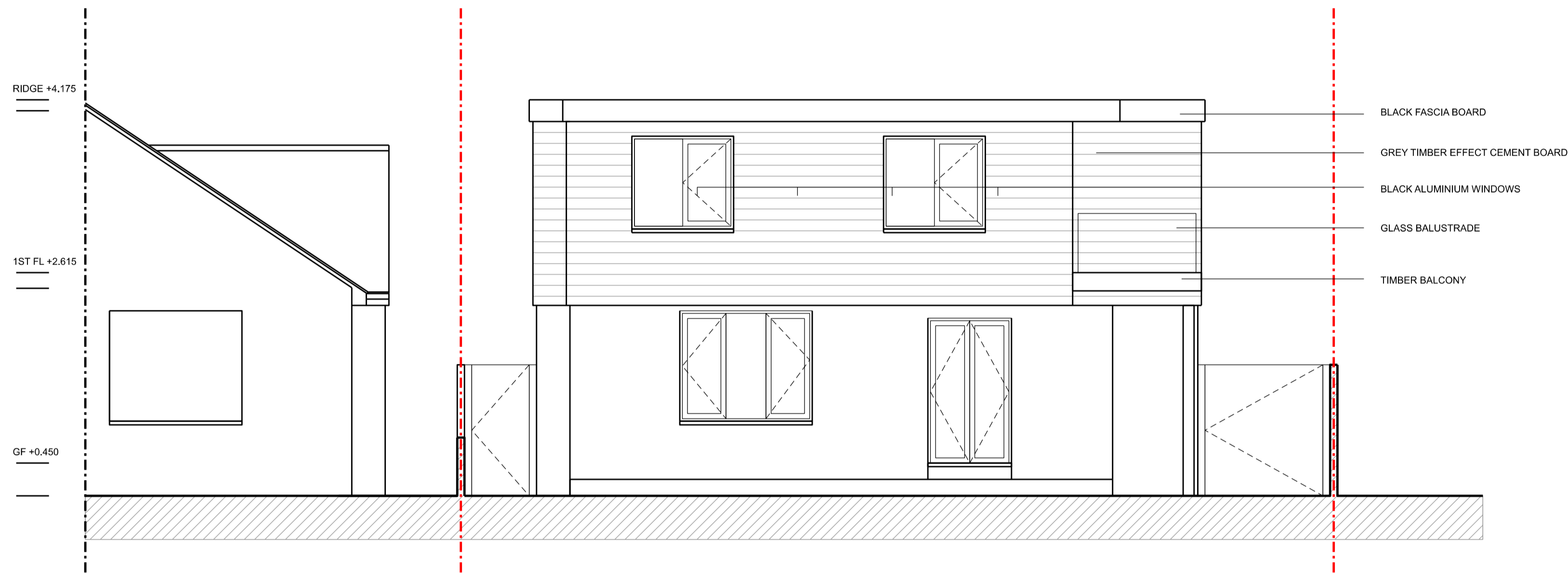
PROPOSED REAR ELEVATION 1.50@A1