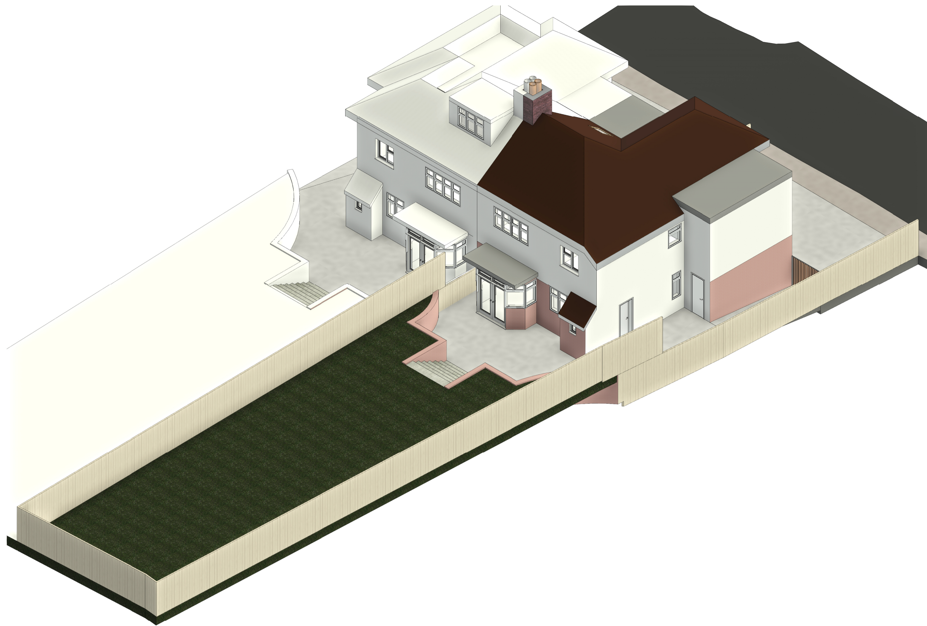
Rear 3D - Existing