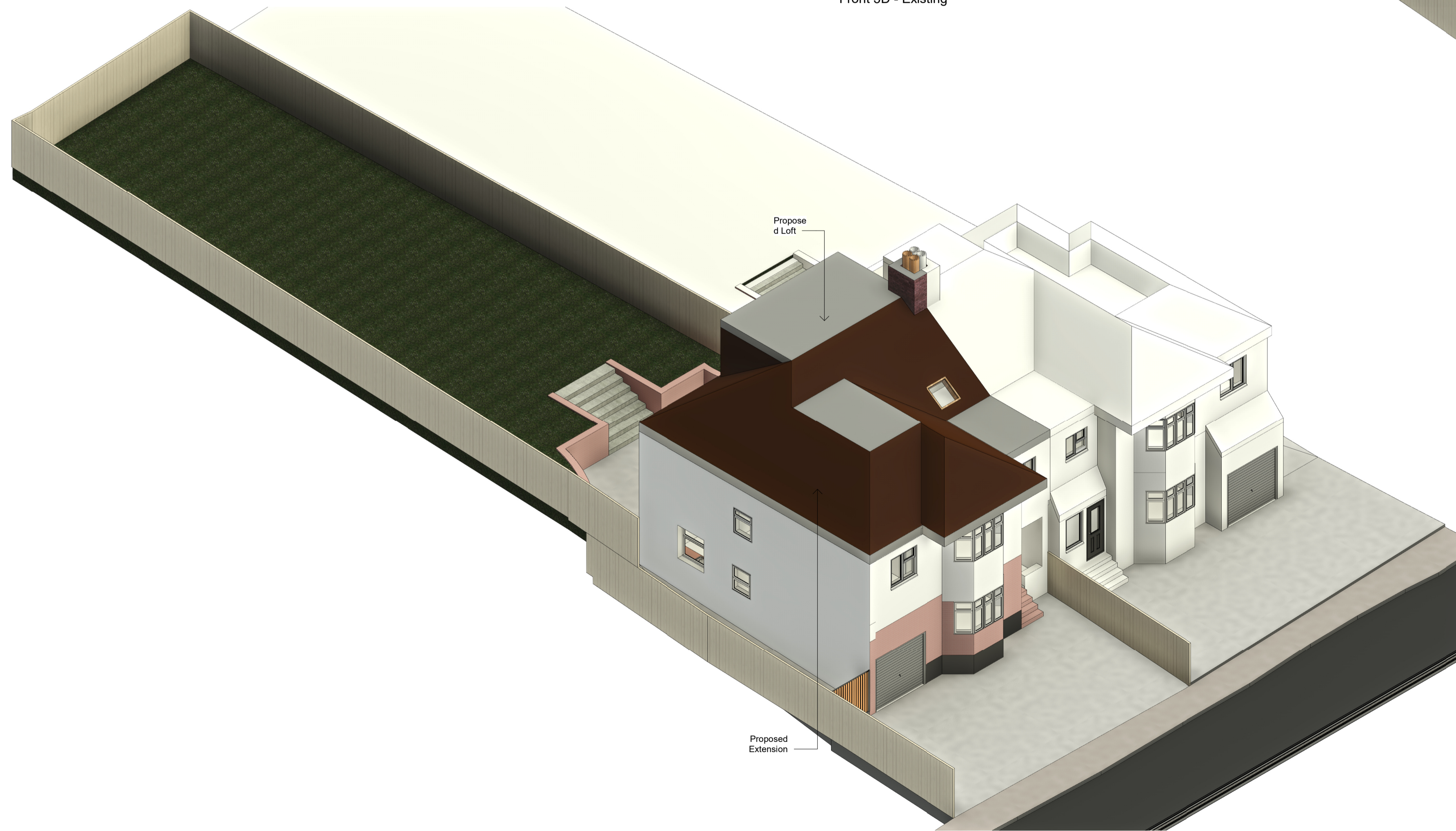
Front 3D - Proposed