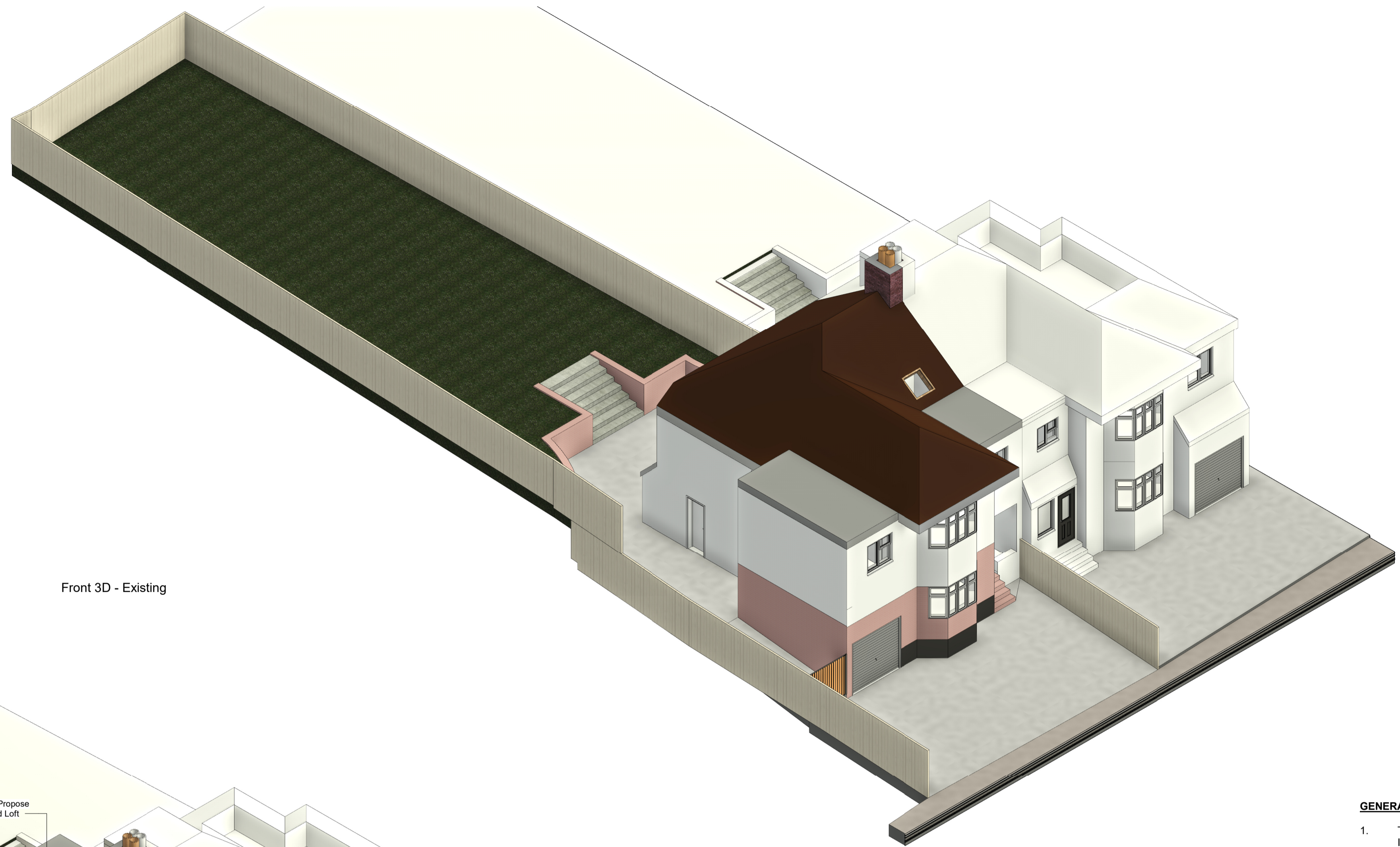
Front 3D - Existing