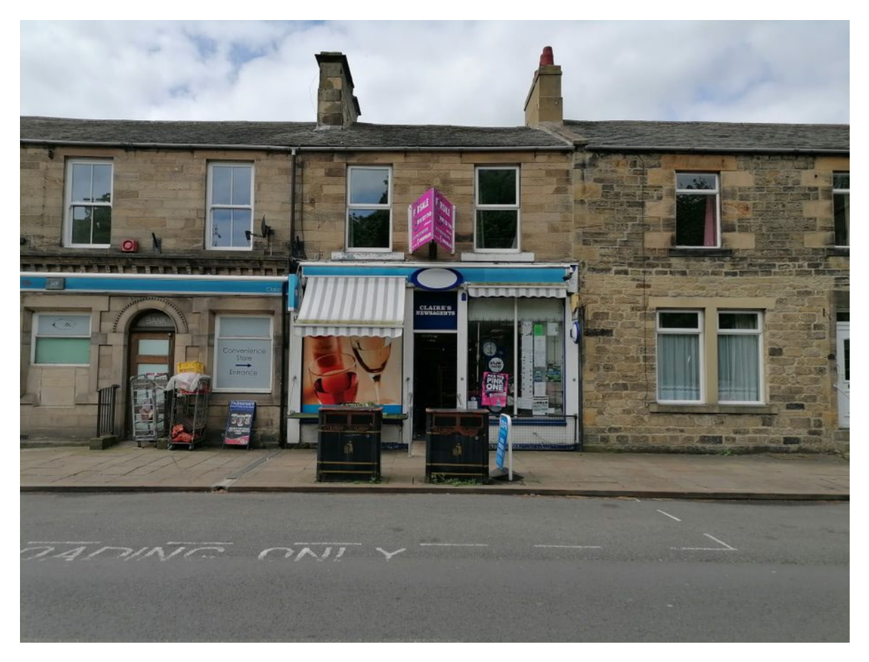
Figure 1 Claire's Newsagents

The site is located in the village of of Haydon Bridge to the east. The application is to replace the existing illuminated signage with The Premier branding and install security shutters.