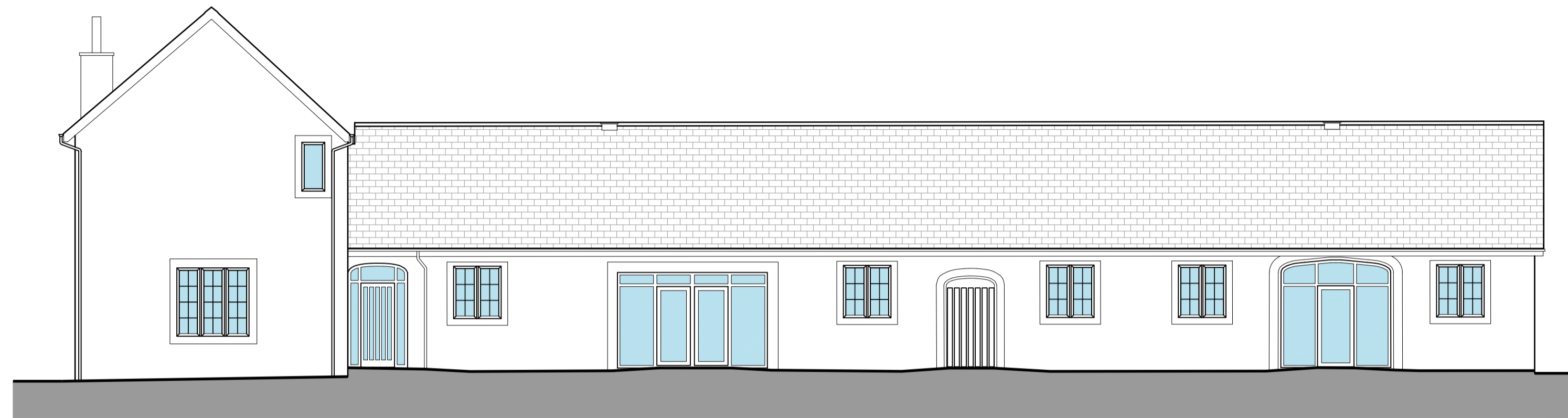
Existing South East Elevation