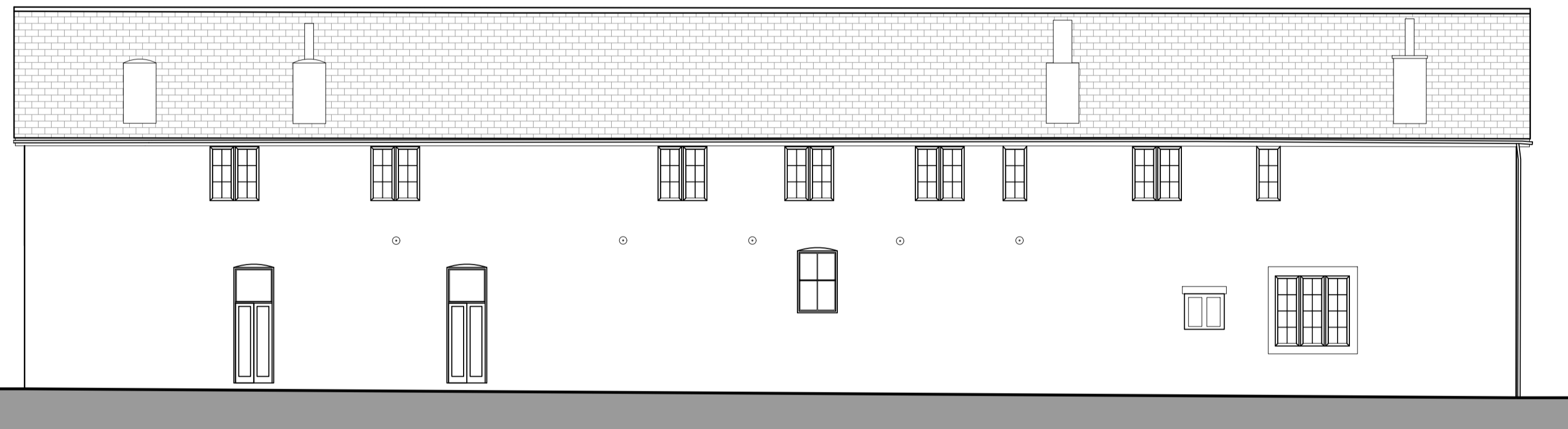
Existing South West Elevation