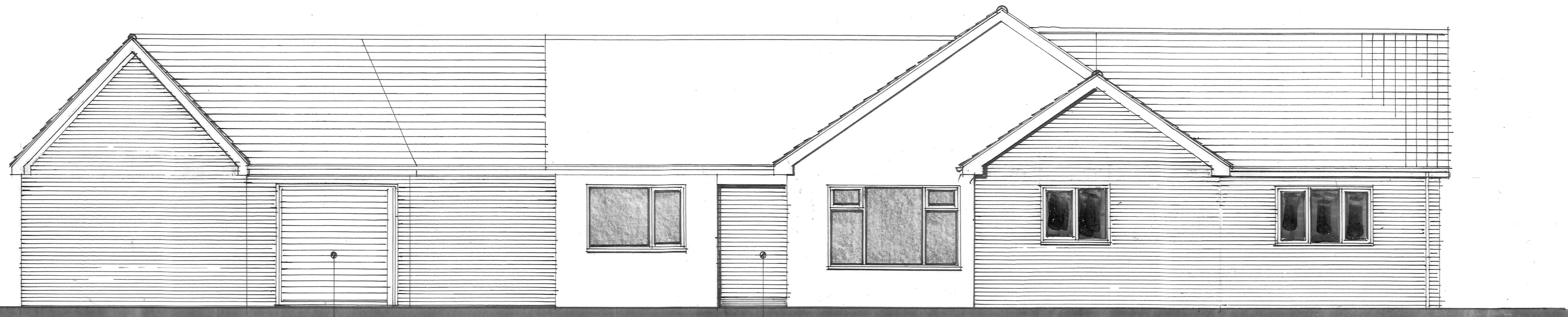
FRONT ELEVATION SOUTH-EAST