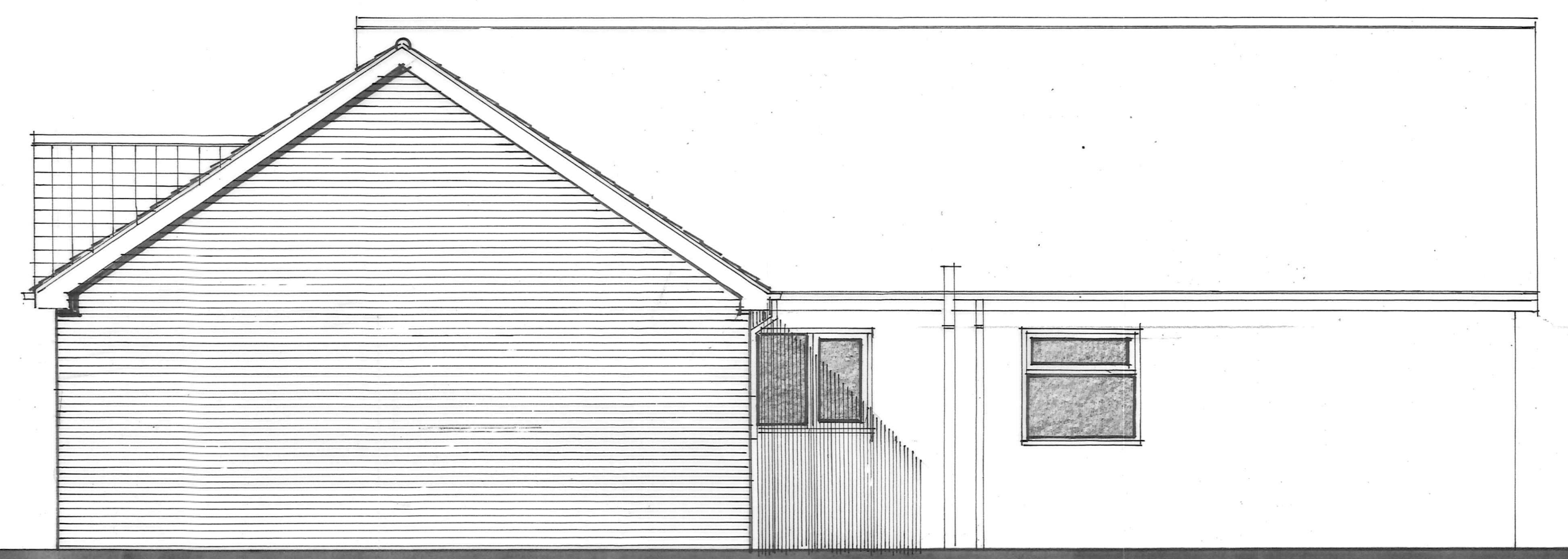
SIDE ELEVATION NORTH-EAST

CLIENT MR and MRS L CRITCHLEY DATE MAY 2023 PROJECT PROPOSED ALTERATIONS AND EXTENSIONS SCALE 1:50 LOCATION 17 DENE CLOSE SKELLINGTHORPE LINCOLN DWG No 32/23/05 DRAWING PROPOSALS - ELEVATIONS REVISION