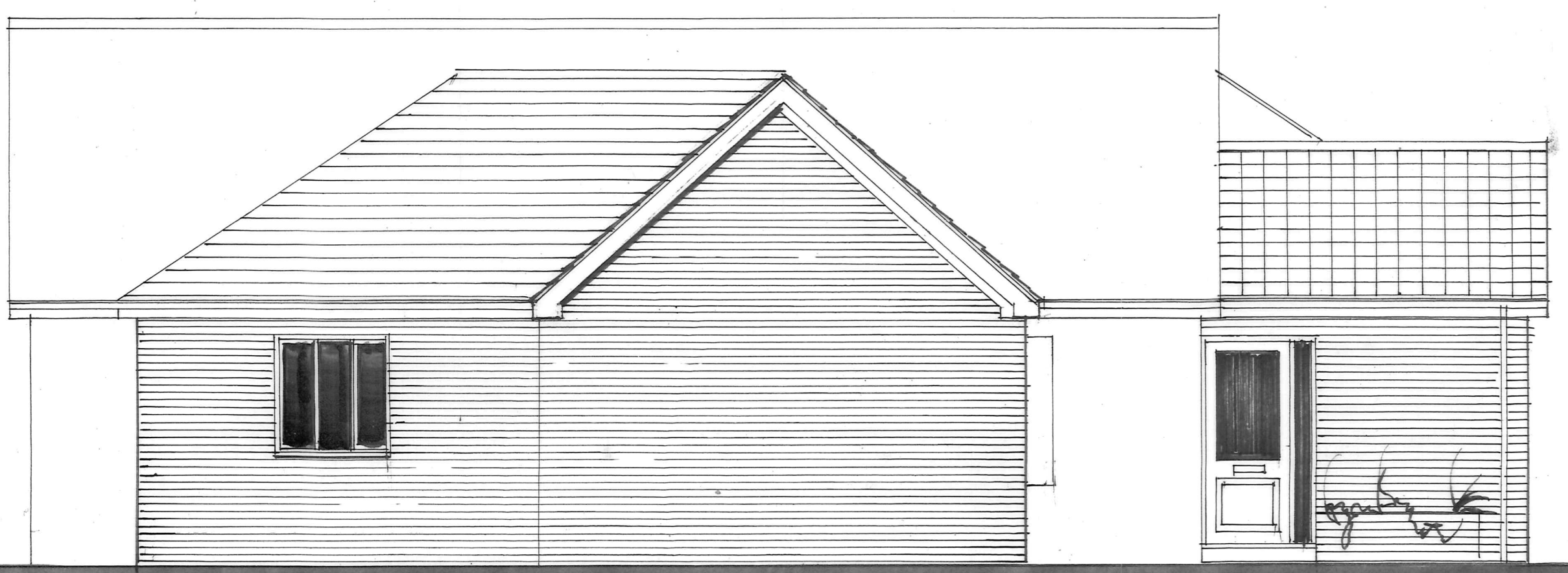
SIDE ELEVATION SOUTH - WEST