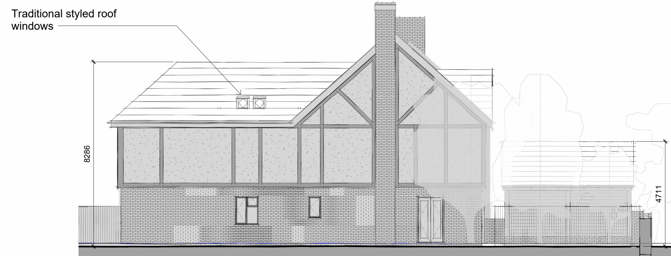
NORTH - WEST ELEVATION 1 : 100