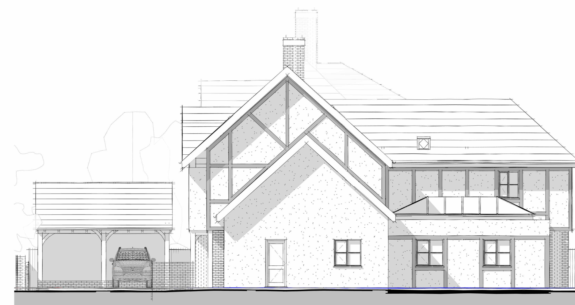
SOUTH-EAST ELEVATION 1 : 100