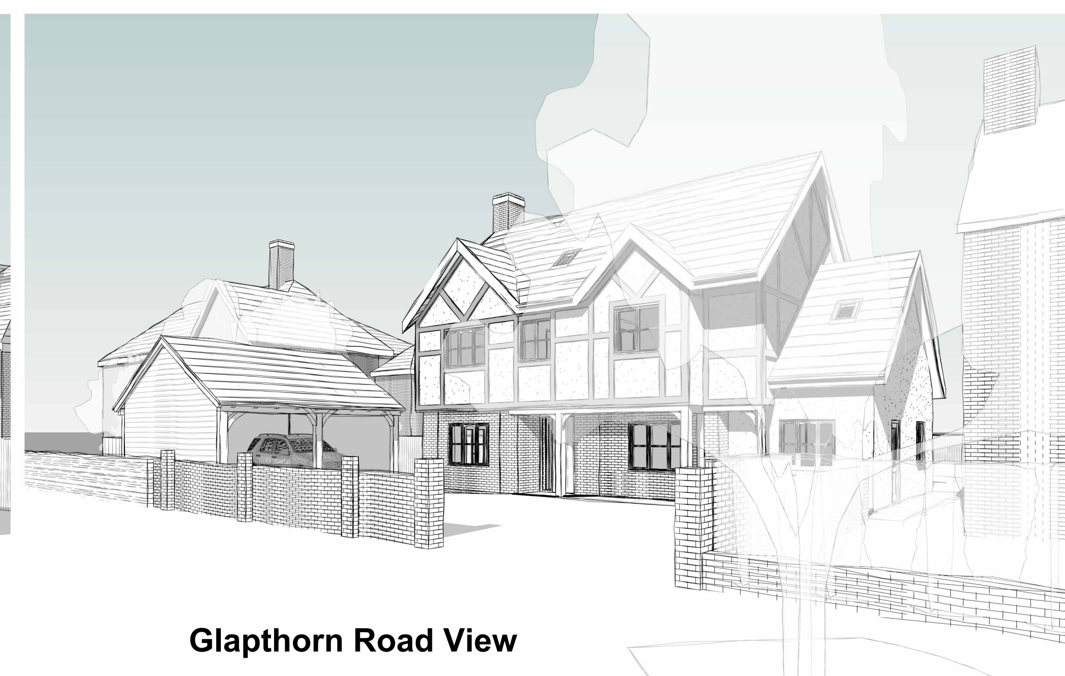
Glaphorn Road View

Existing entrance unchanged. Existing driveway hard bound Existing brick wall