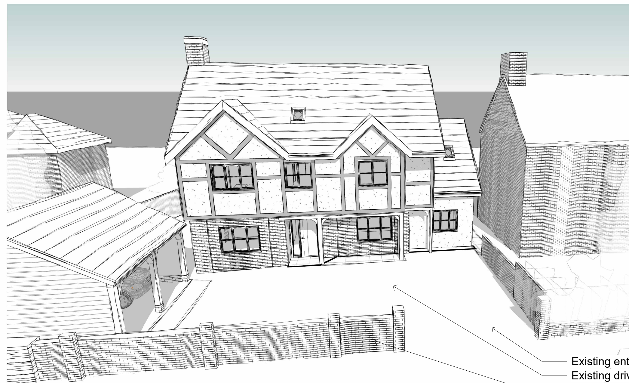
Elevated Front Elevation