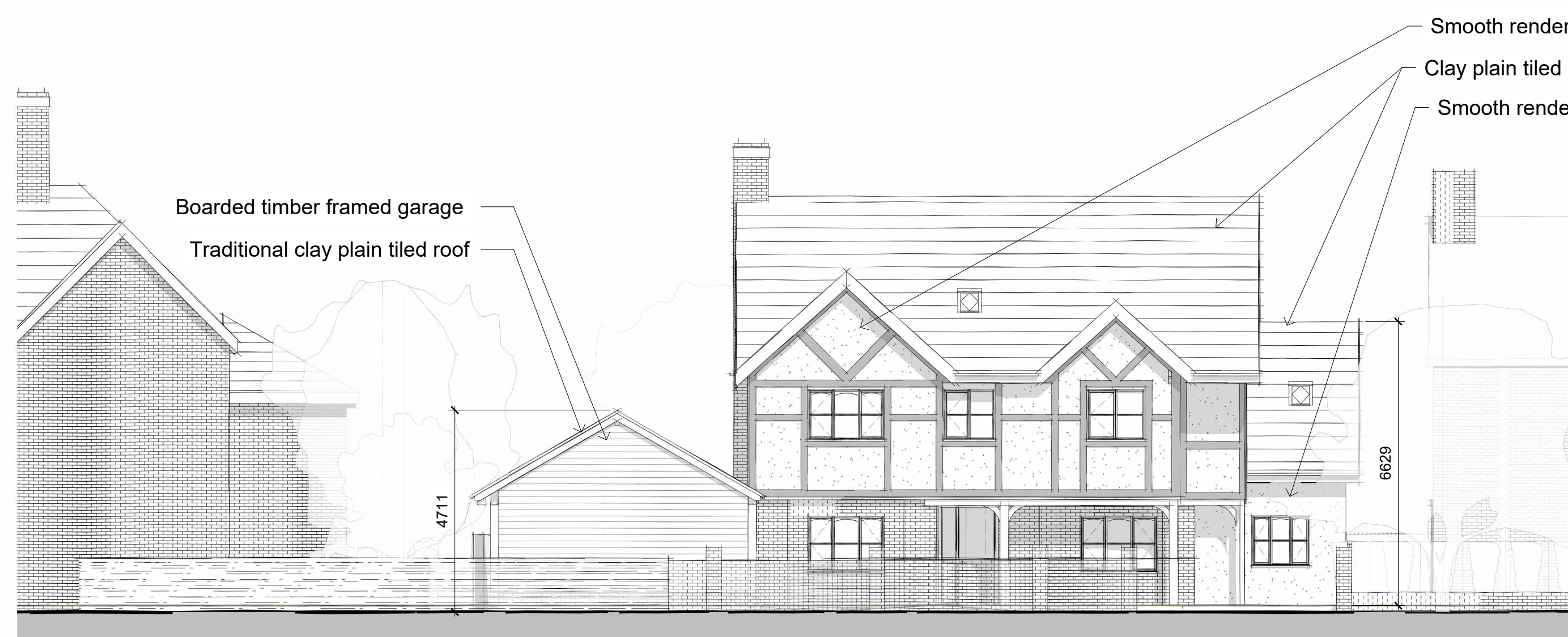
SOUTH - WEST ELEVATION 1 : 100