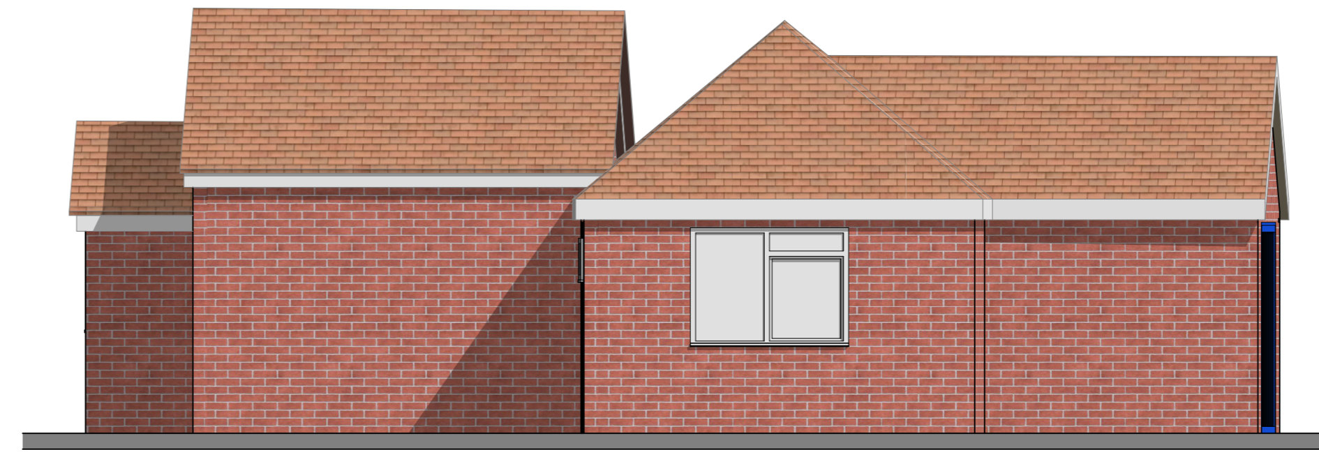
CT2-1 | Elevation | 1:50