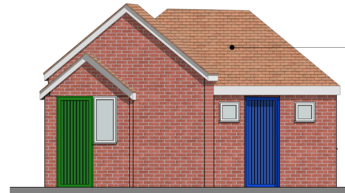
CT2-2 | Elevation | 1:50