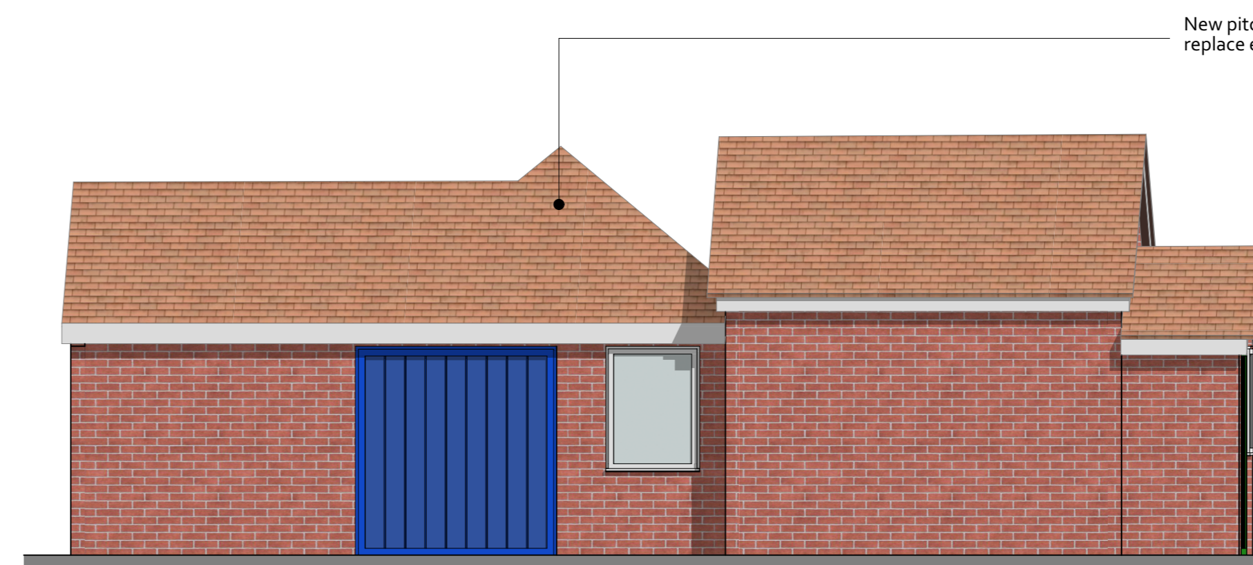
CT2-4 | Elevation | 1:50