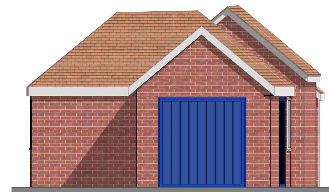
CT2-3 | Elevation | 1:50