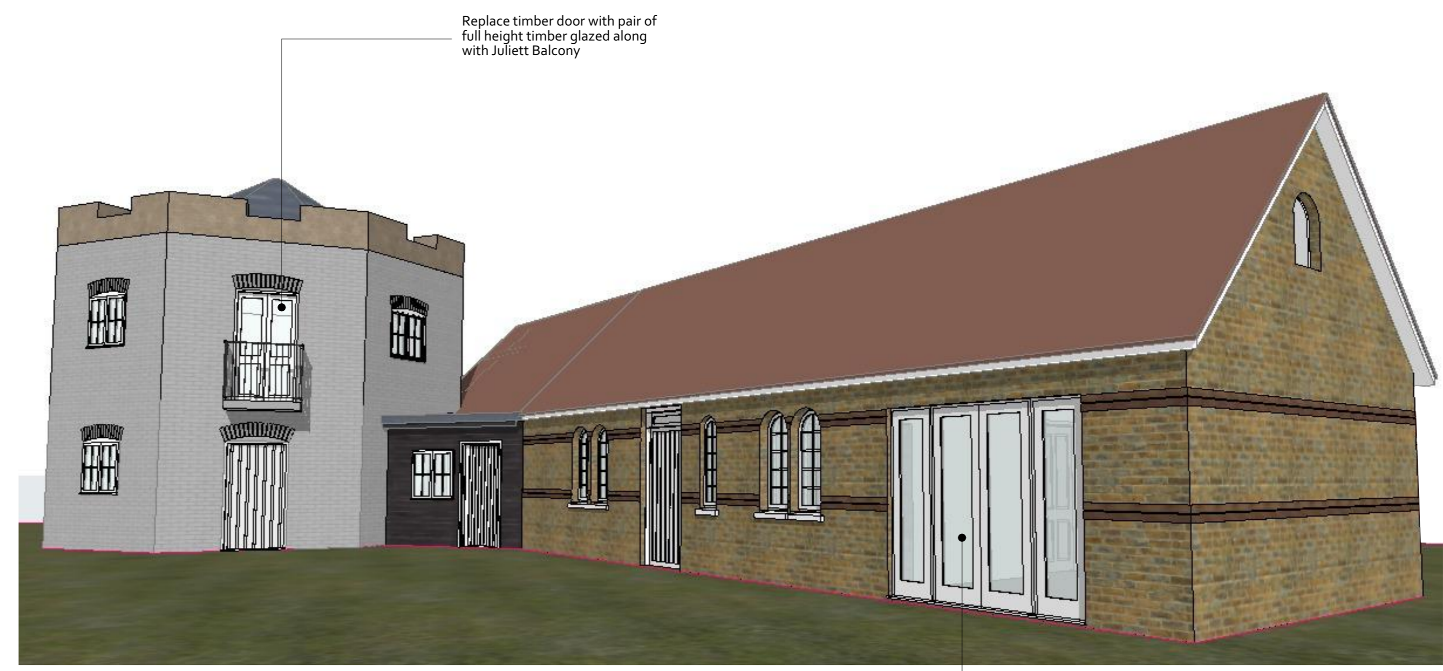
3 | 3D Perspective | As Proposed |