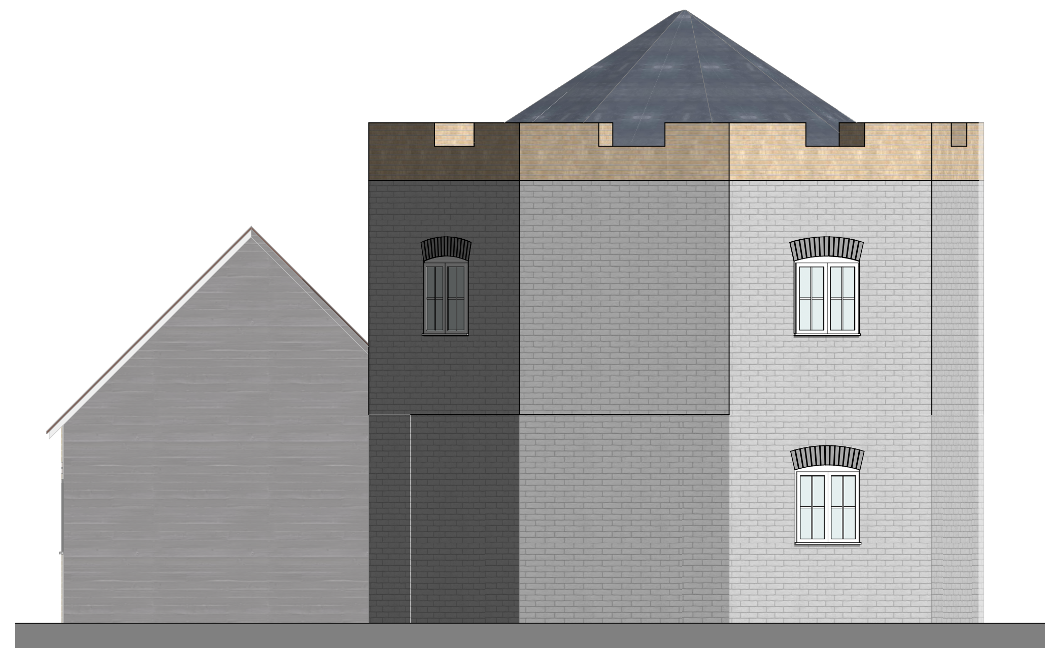
3 | WM8 Elevation | 1:50