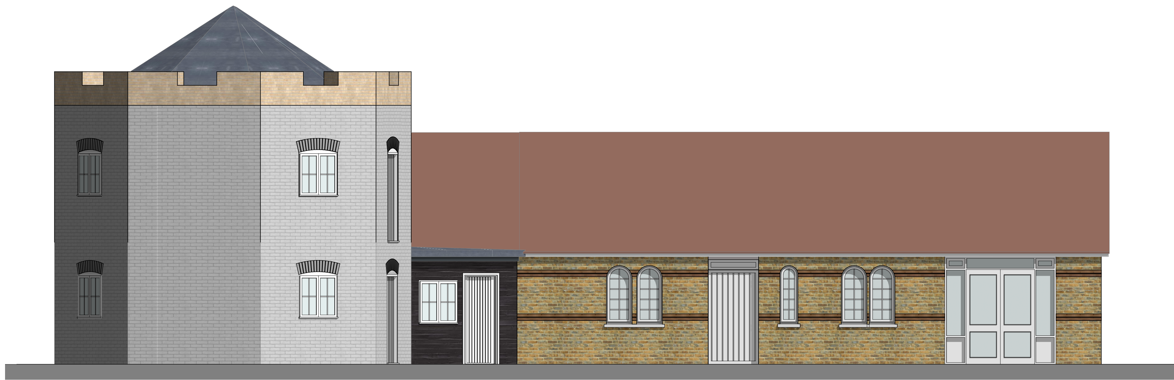
1 | WM6 Elevation | 1:50