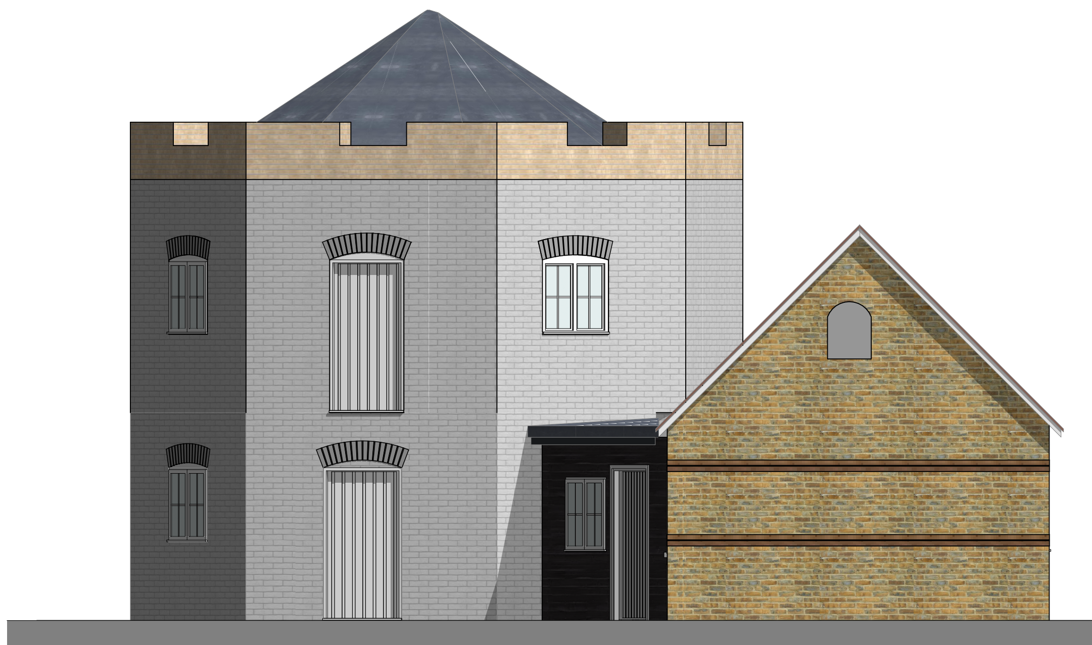
2 | WM5 Elevation | 1:50