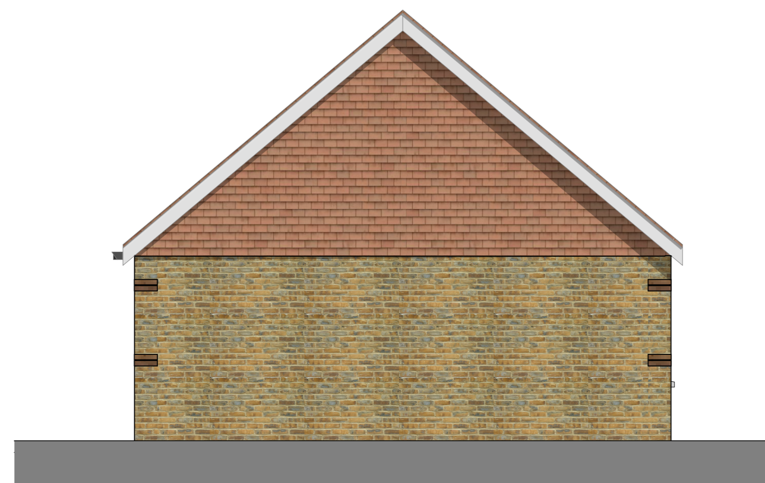
5 | CT1-3 Right Flank Elevation | 1:50