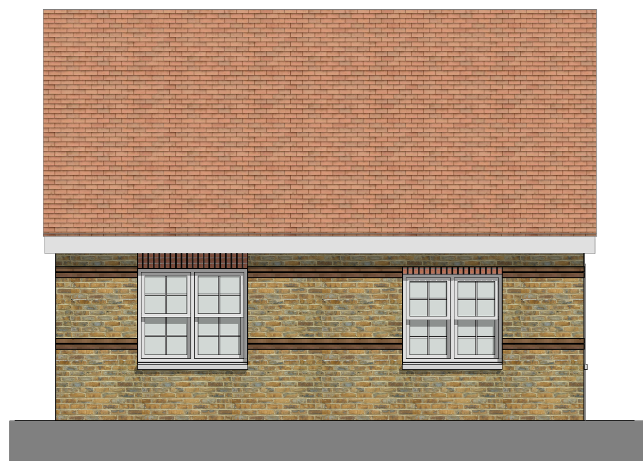
4 | CT1-4 Rear Elevation | 1:50