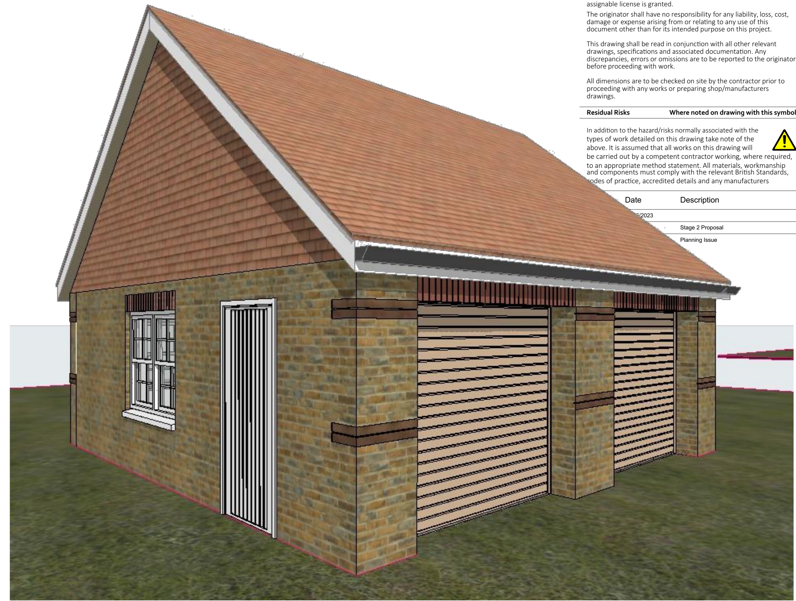
| 3D Perspective - The Garage |