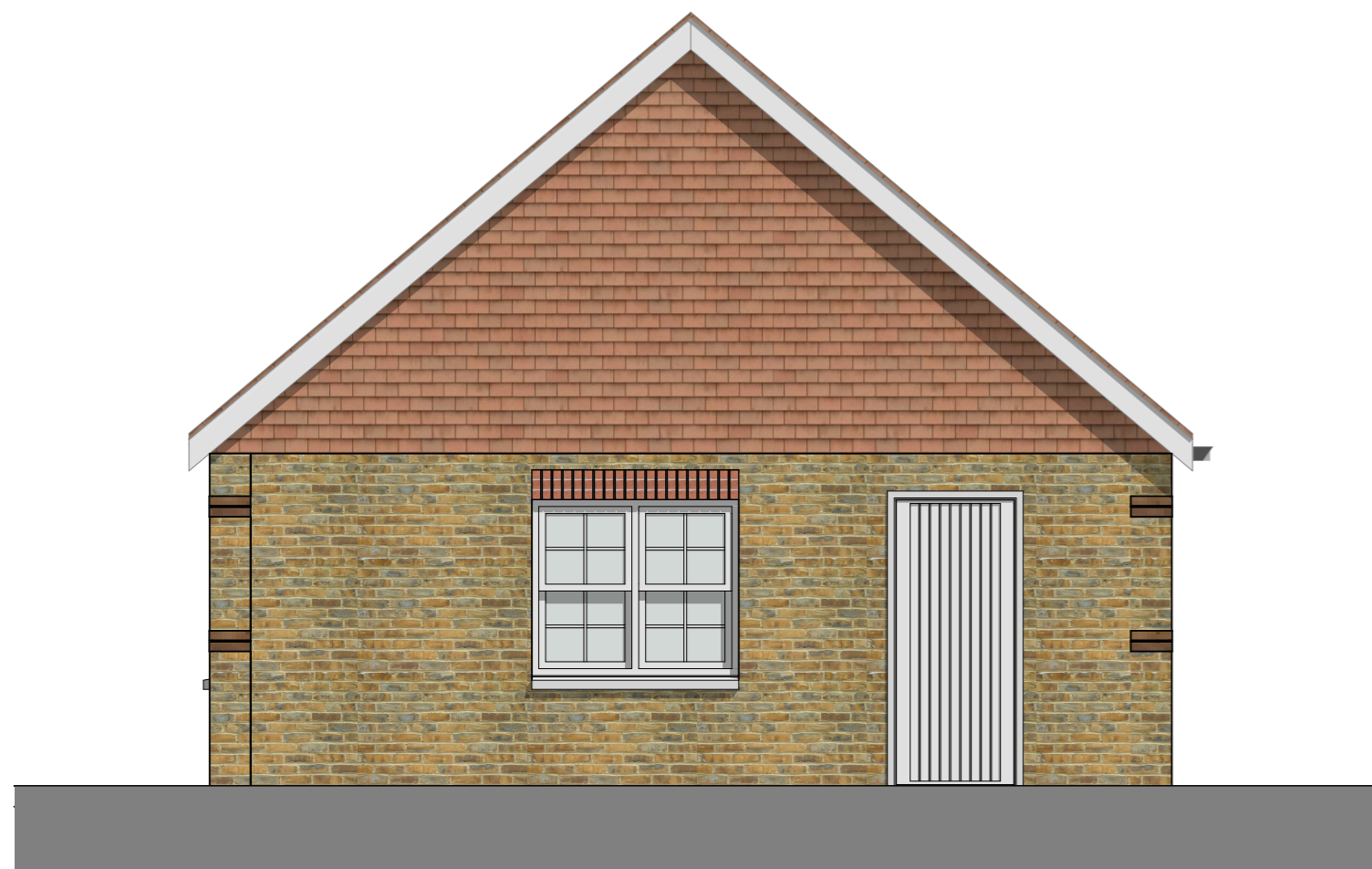
2 | CT1-2 Left Flank Elevation | 1:50