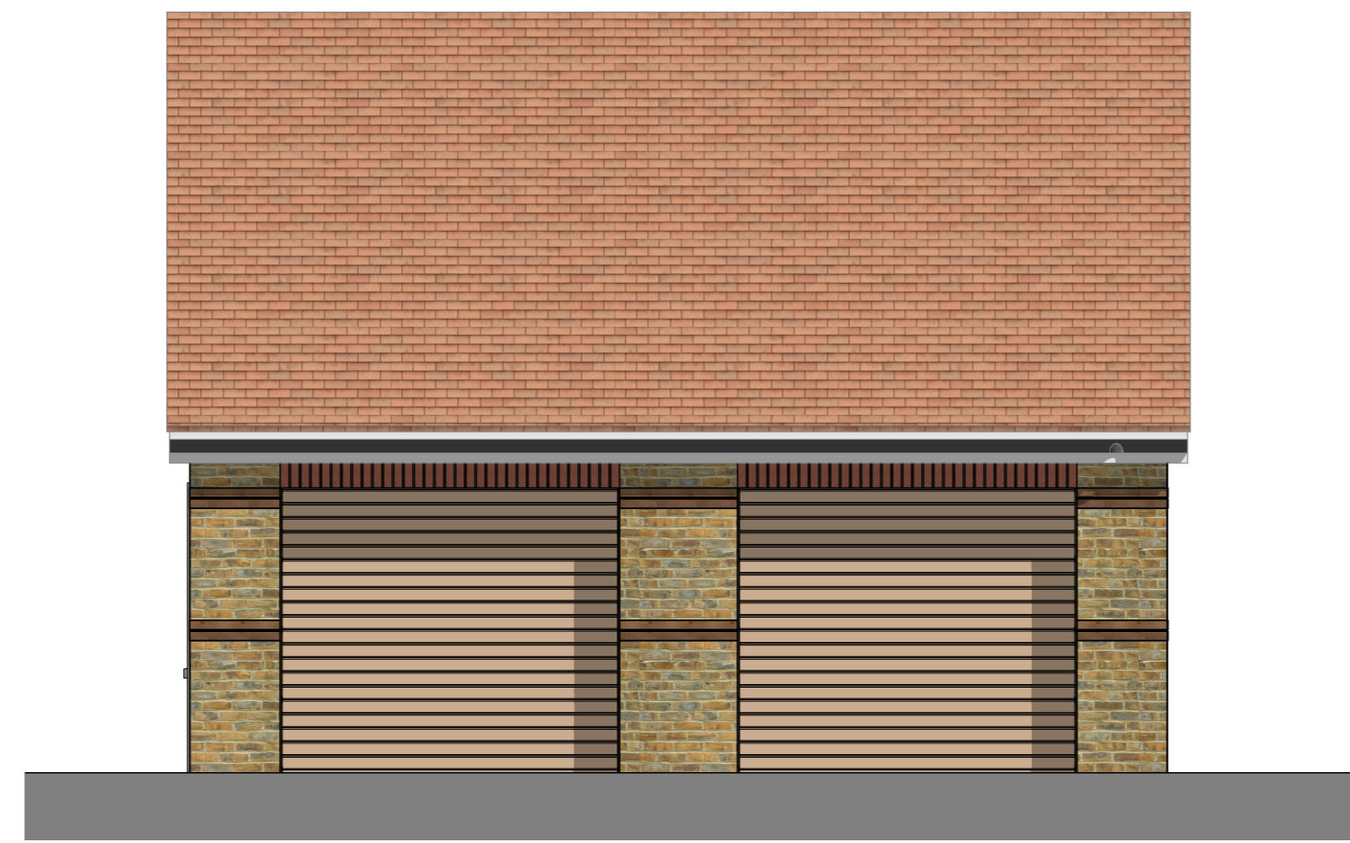
3 | CT1-1 Front Elevation | 1:50