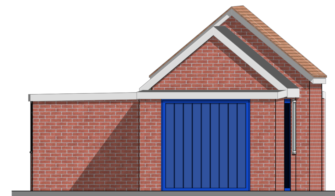
CT2-3 | Elevation | 1:50