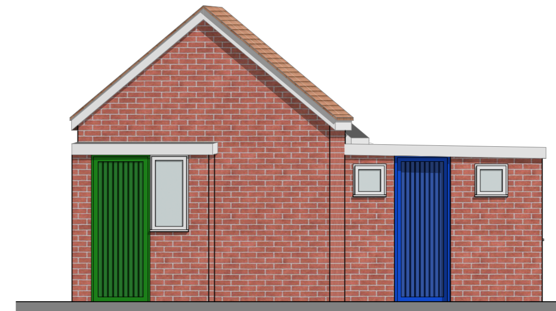
CT2-2 | Elevation | 1:50