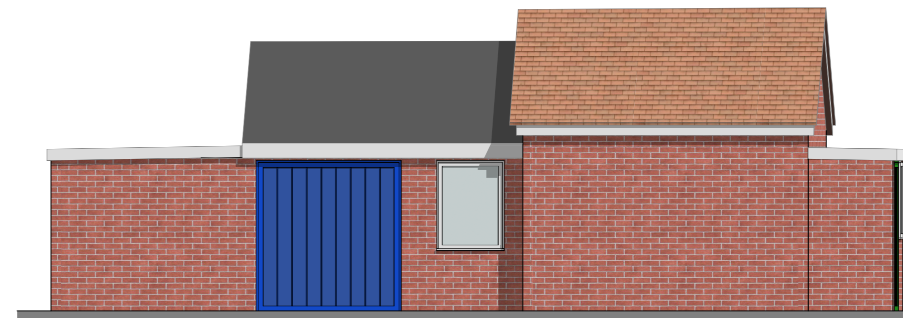
CT2-4 | Elevation | 1:50