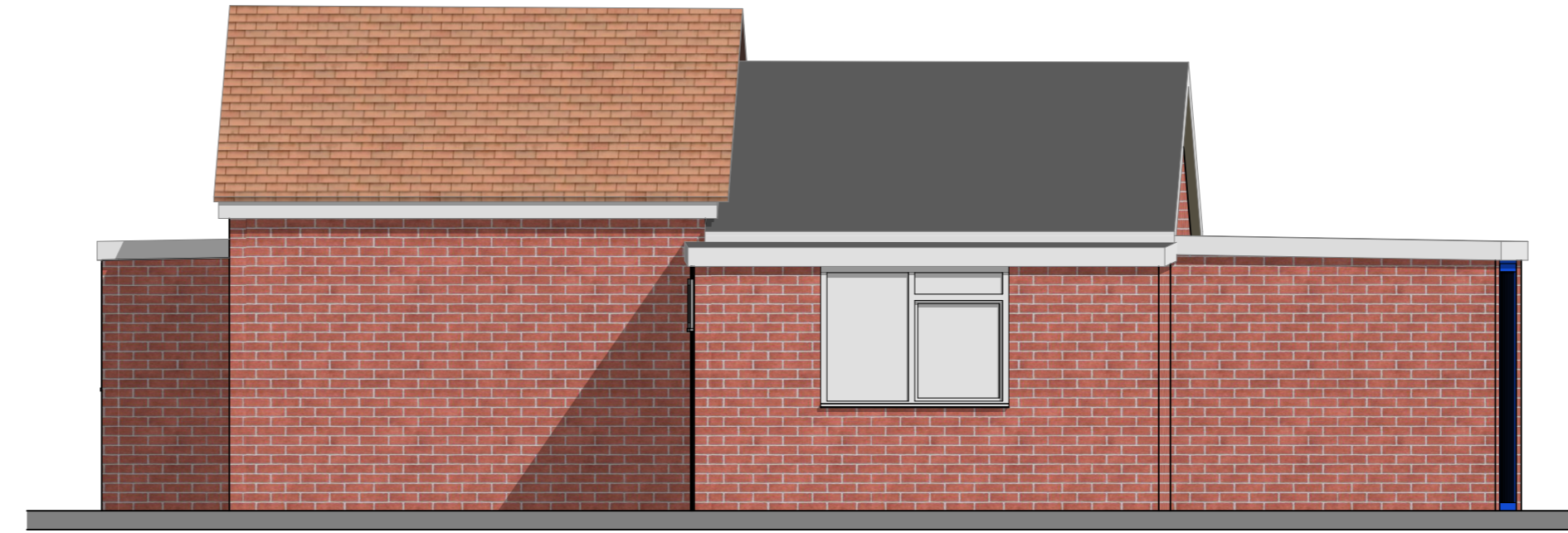
CT2-1 | Elevation | 1:50