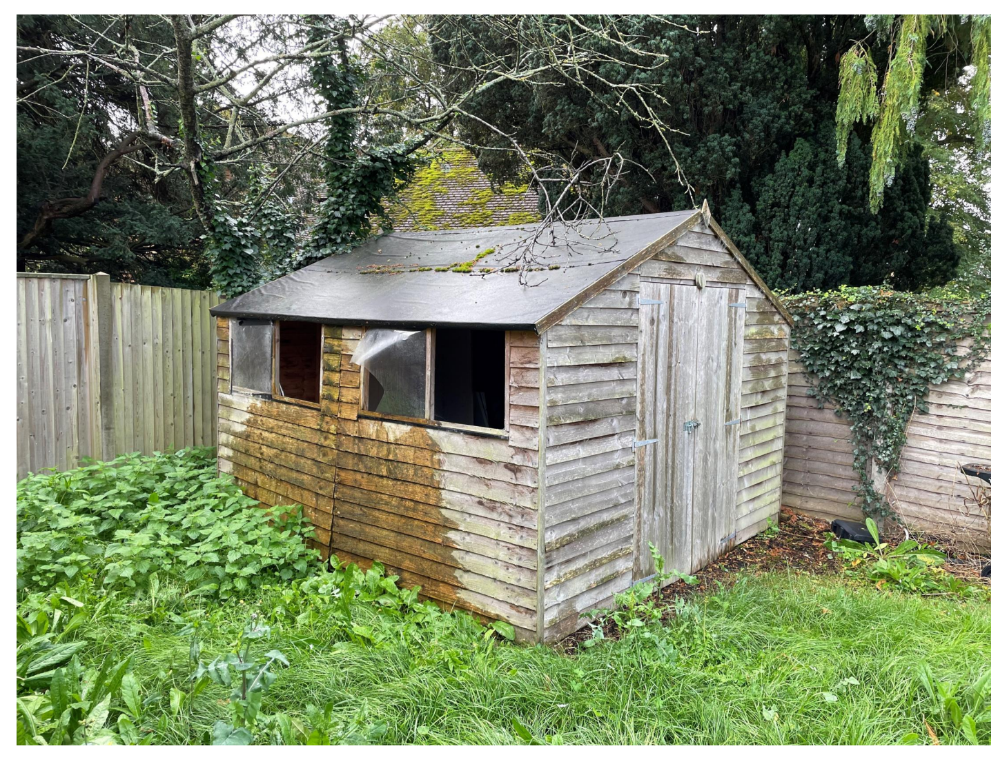
Outbuilding - E Timber Shed