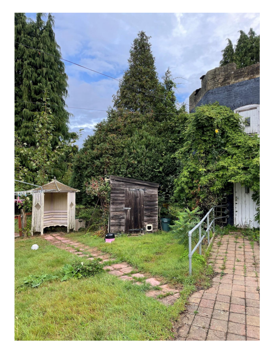
Outbuildings - A (Right) & B (Left) Timber Shed and Covered Seating