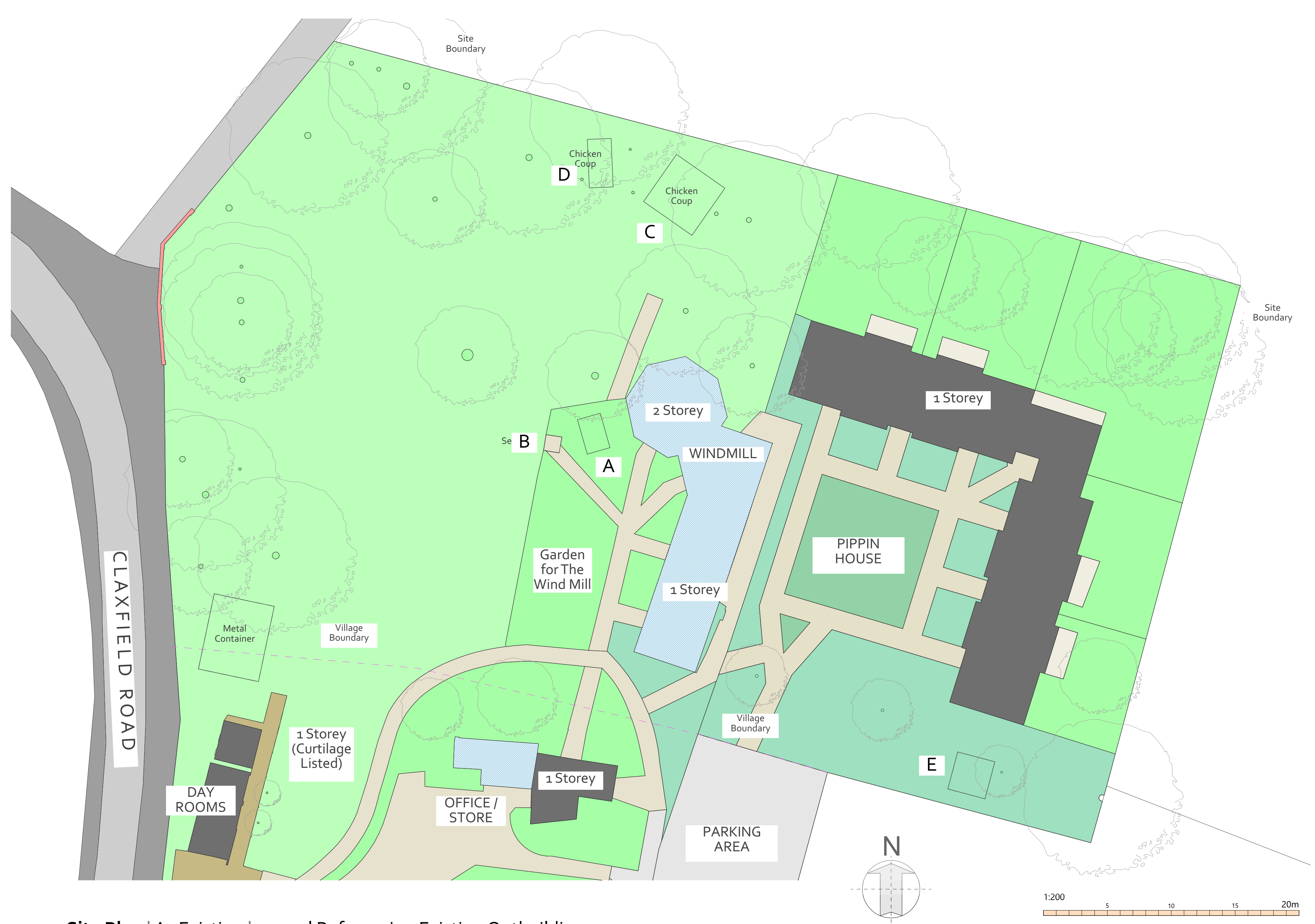
Site Plan | As Existing | 1:200 | Referencing Existing Outbuildings