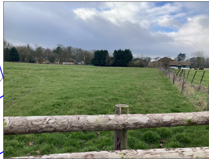
north western boundary