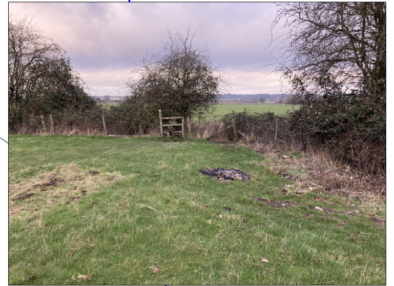
north eastern boundary (and PROW)