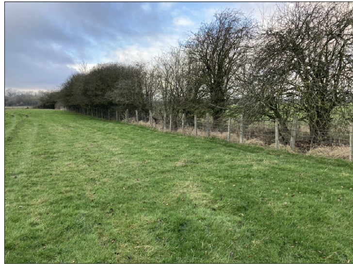
north eastern boundary