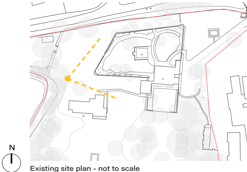
Existing site plan - not to scale