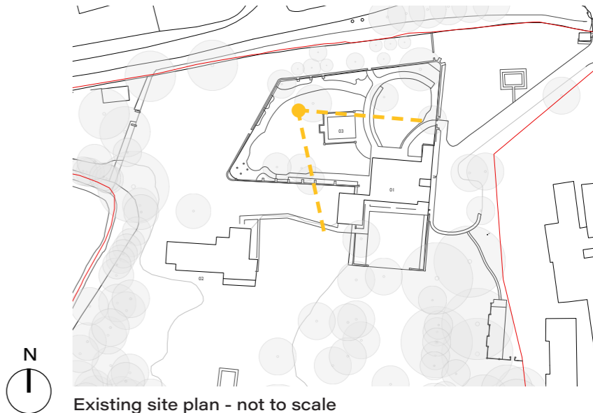
Existing site plan - not to scale