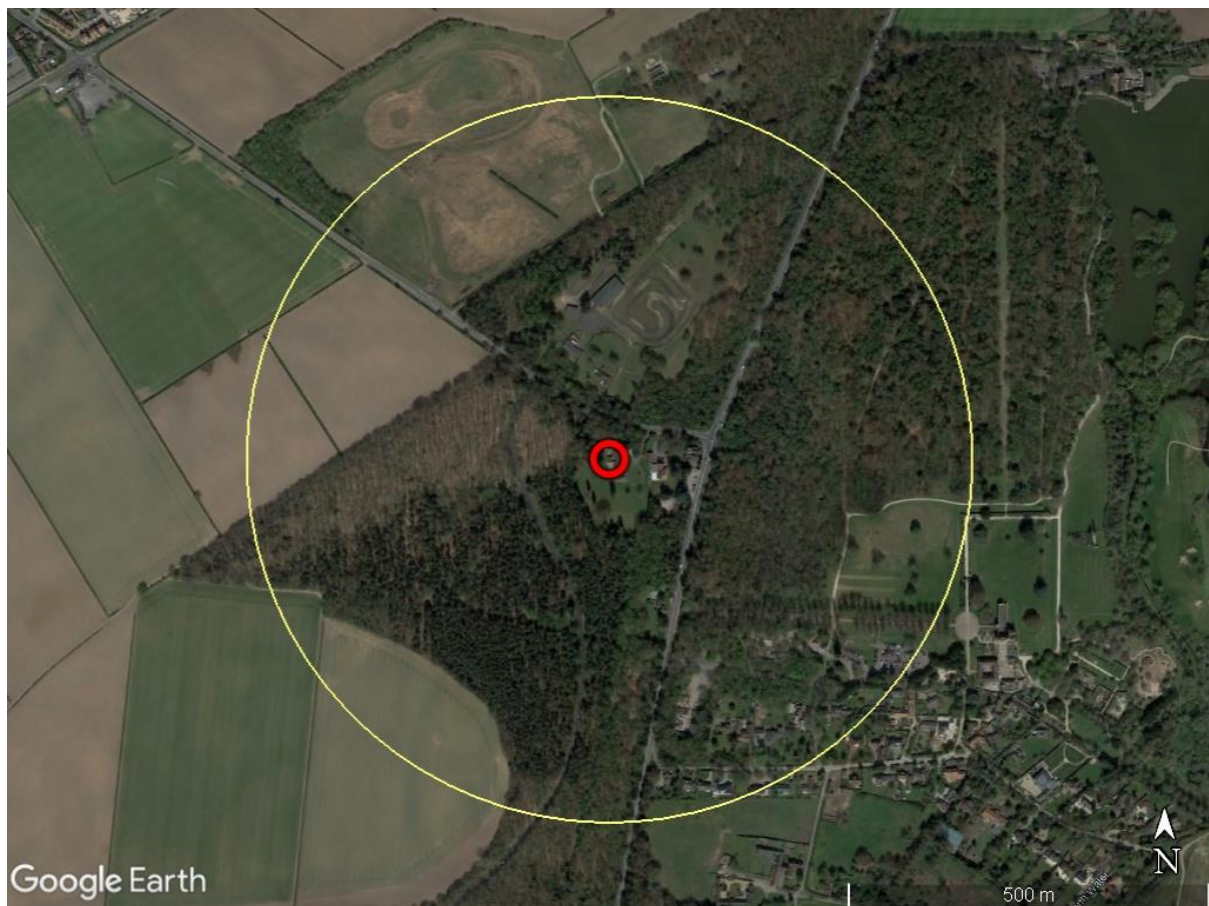
Figure 1 – Site Location

The habitats in the area are highly suitable for foraging and commuting bats.