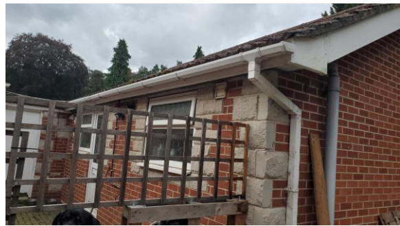
4 east aspect