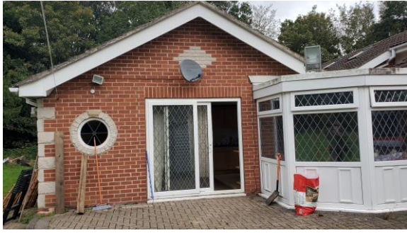
1 south gable