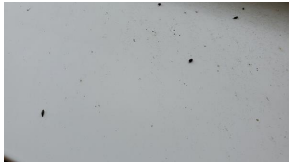
6 bat droppings under roost access