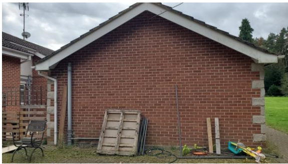
3 north gable