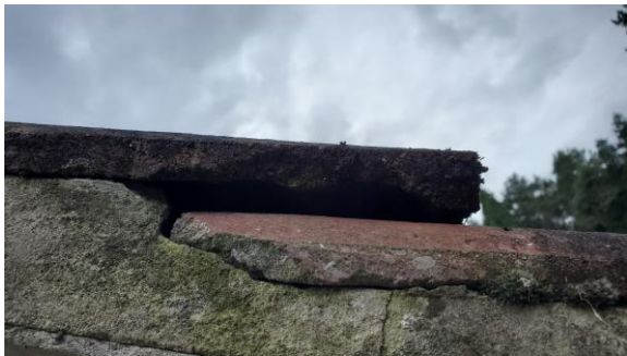
5 gap under tile on north gable (confirmed roost)