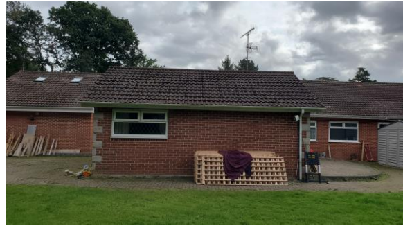
2 west aspect