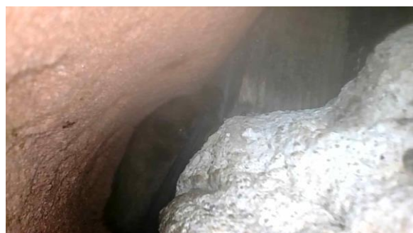
8 bat under roof tile. Poor image due to light reflecting from cement closer to the endoscope