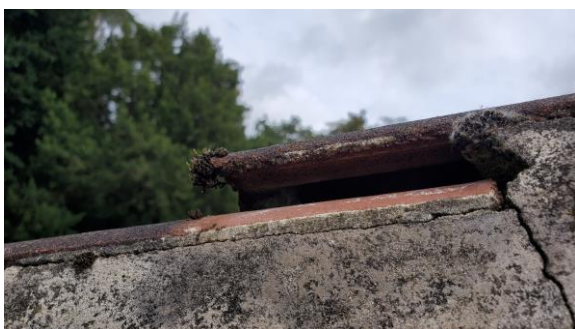
7 gap under tile on south gable (possible access)