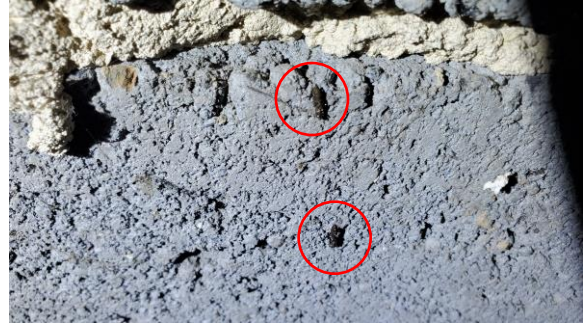
10 bat droppings on internal gable wall