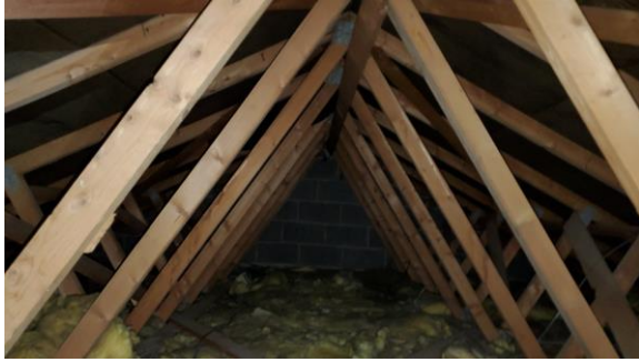
9 internal view of loft