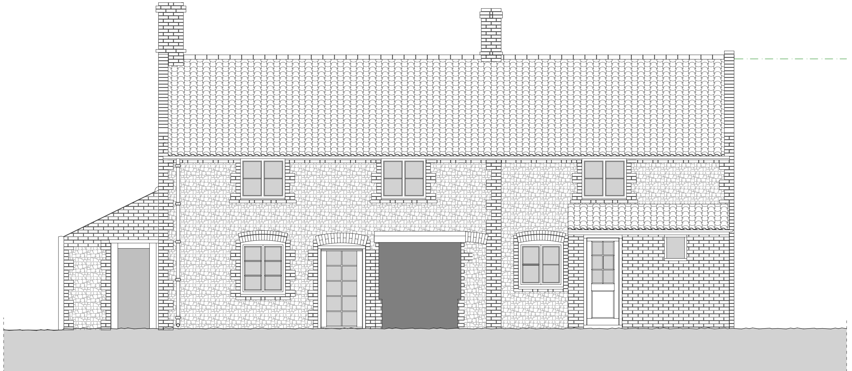
Existing South Elevation - 1:50