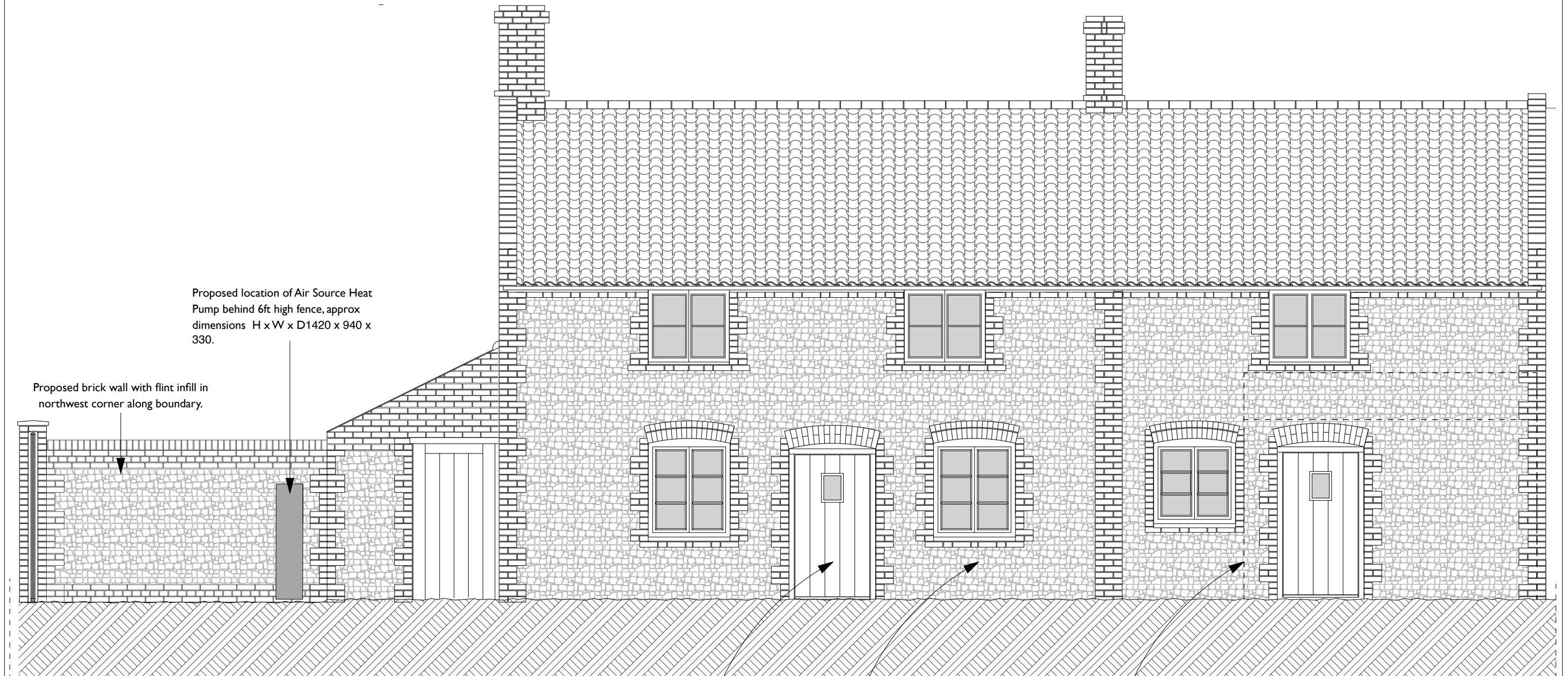
Proposed South Elevation - 1:50 @A3

All windows on south side - require new high quality pine casements with a painted finish and will be glazed with Fineo glazing - 8mm thick highly insulating to maintain the original size of the glazing bars and jambs.