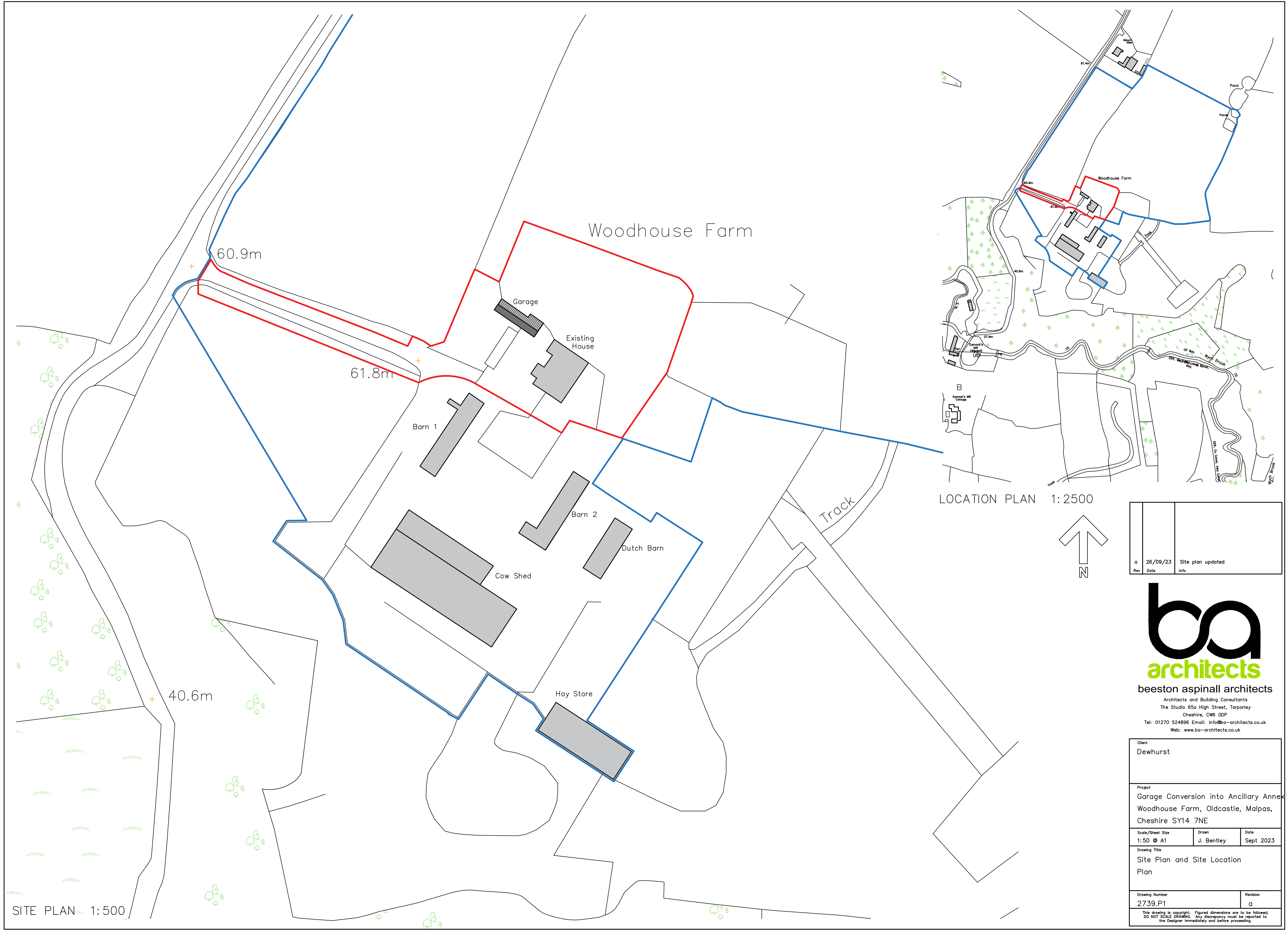
SITE PLAN 1: 500