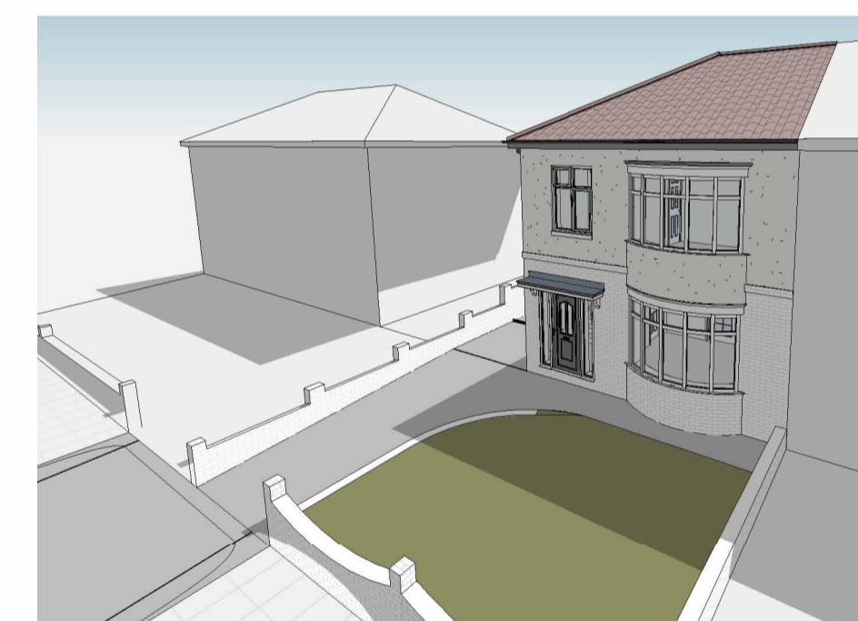
⑤ Existing 3D View 2