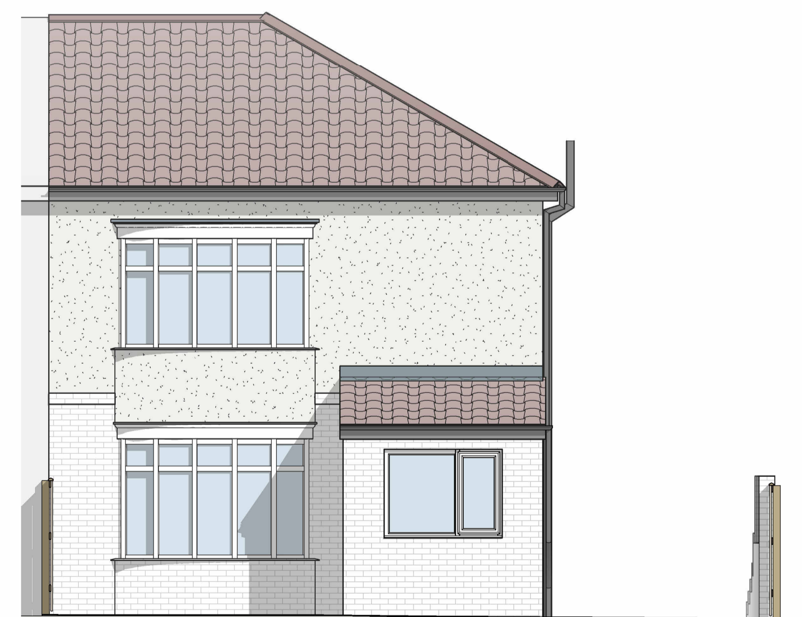
③ Existing Elevation Facing South 1:50