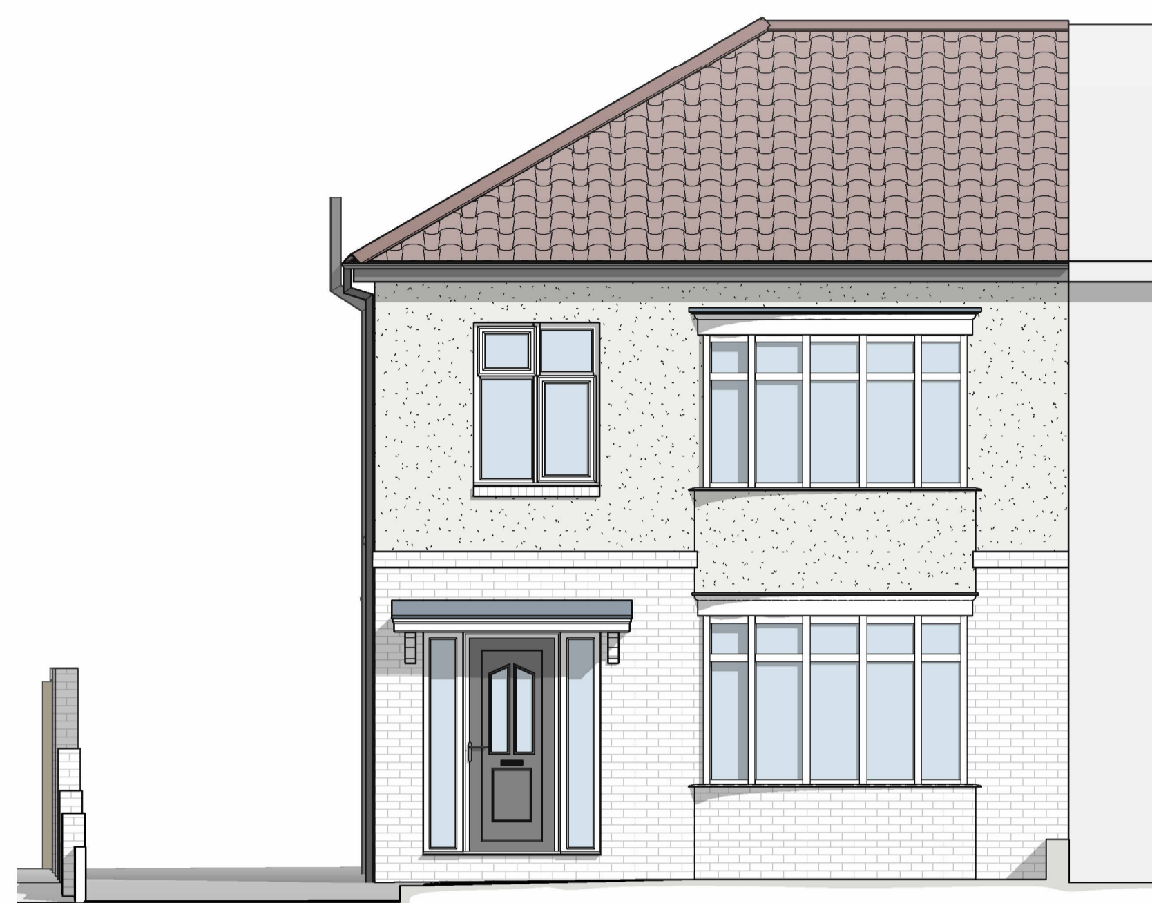
① Existing Elevation Facing North 1:50

THIS DRAWING HAS BEEN PRODUCED FOR THE PURPOSES OF PLANNING AND BUILDING REGULATION APPROVALS ONLY. WHEREAS EVERY EFFORT HAS BEEN MADE TO ENSURE THE ACCURACY OF THIS DOCUMENT IT IS NOT INTENDED TO BE USED AS A MANUFACTURING DRAWING. IT IS THE SOLE RESPONSIBILITY OF ANY TRADESMEN USING THIS DRAWING FOR THE PROCUREMENT OF MATERIALS OR BUILDING WORK TO CHECK ANY DIMENSIONS ON SITE PRIOR TO THE COMMENCEMENT OF THEIR WORK. DO NOT SCALE.