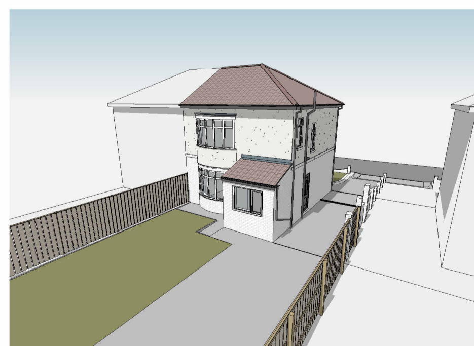
⑥ Existing 3D View 3