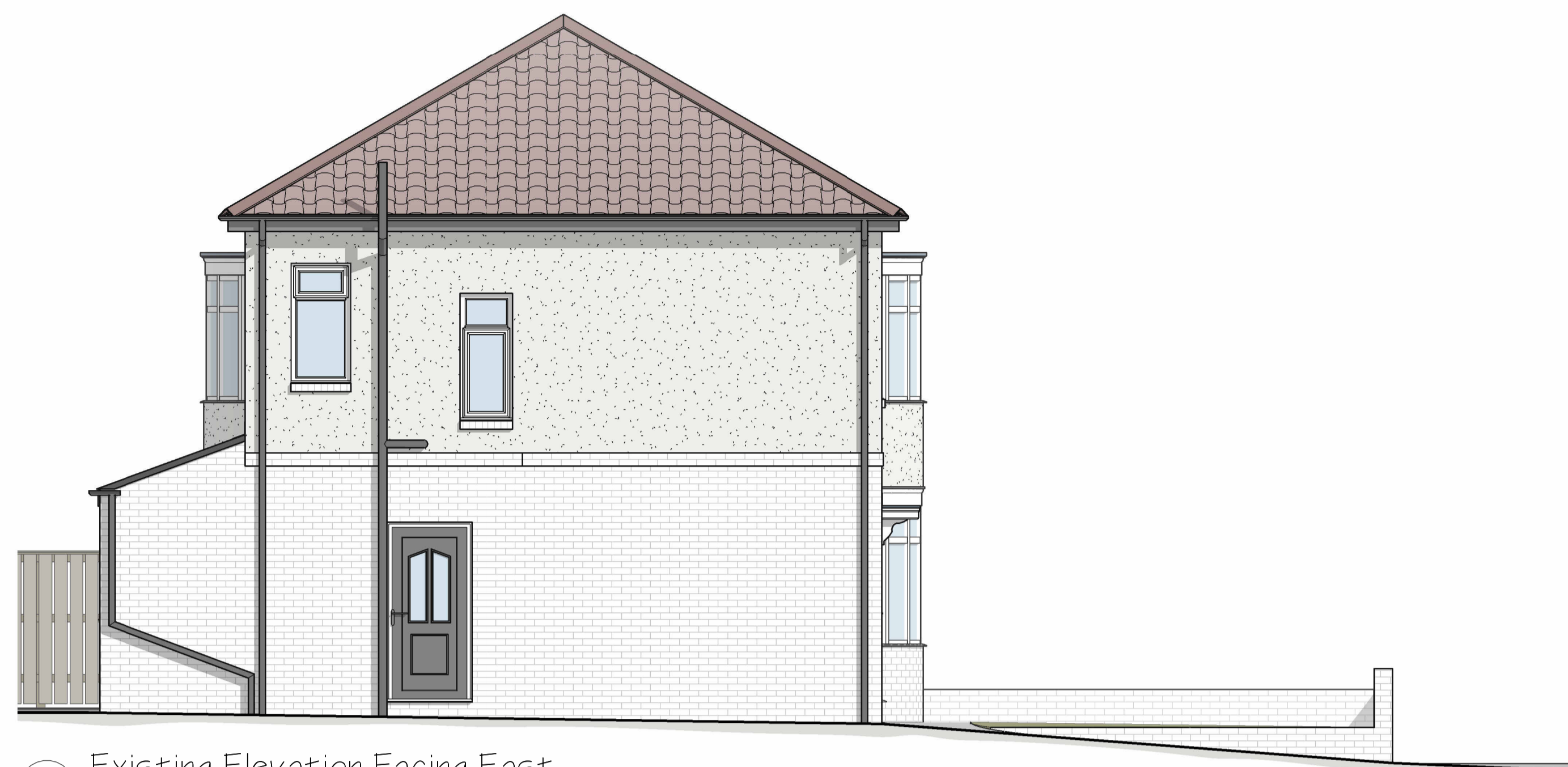
② Existing Elevation Facing East 1:50