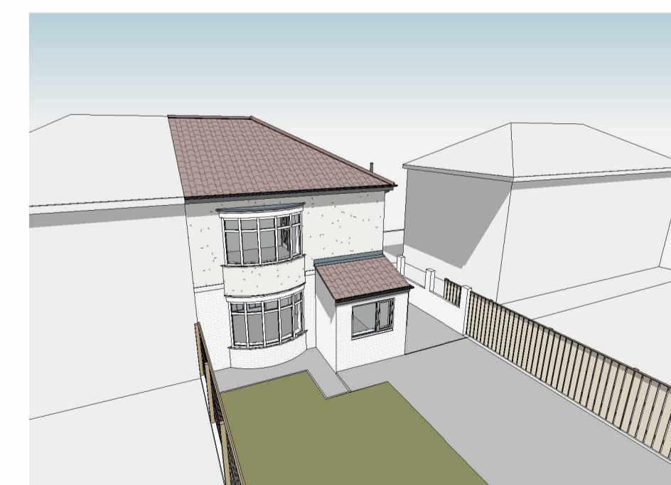
⑦ Existing 3D View 4