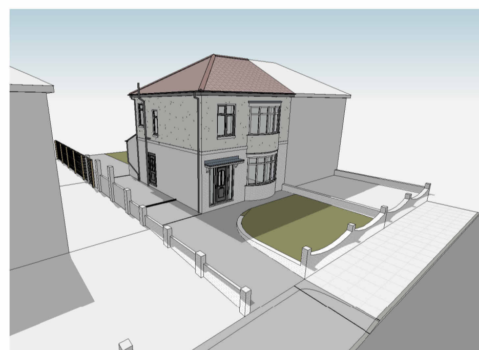
④ Existing 3D View 1