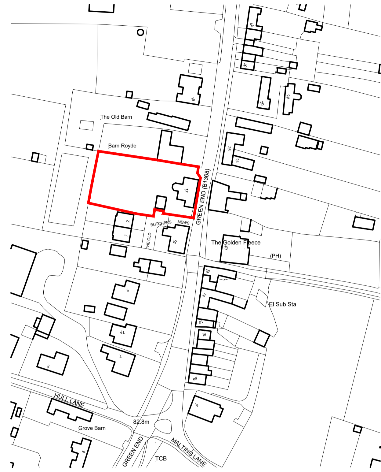
LOCATION PLAN 1/1250 @ A1