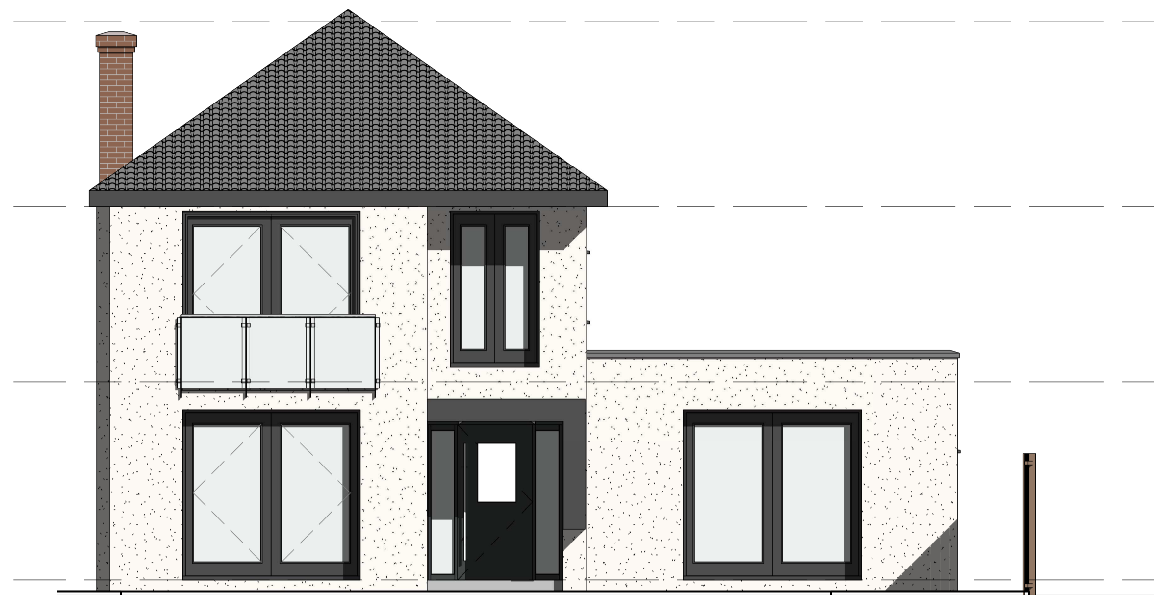
1 Front Elevation 1 : 50