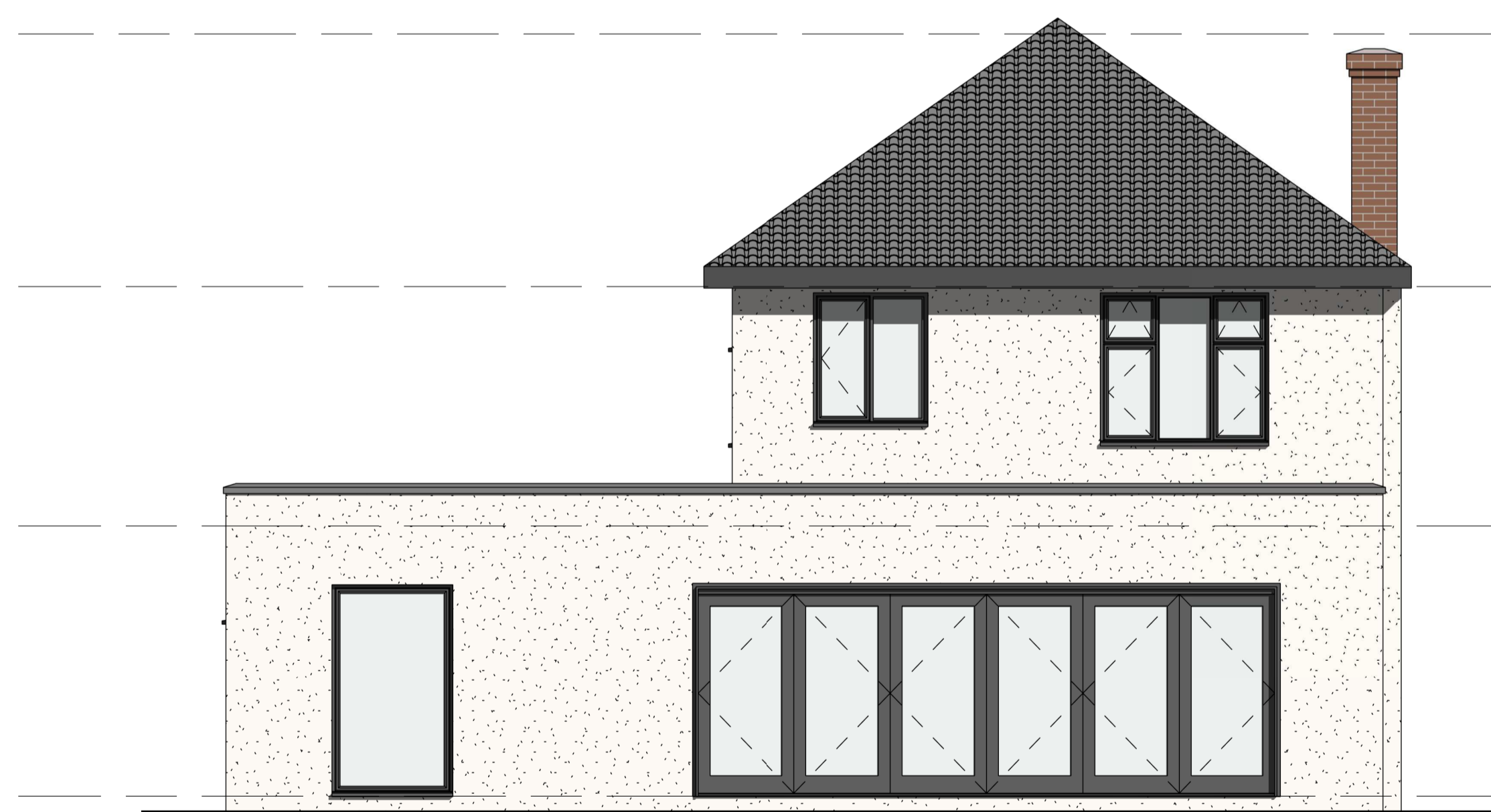
3 Rear Elevation 1 : 50