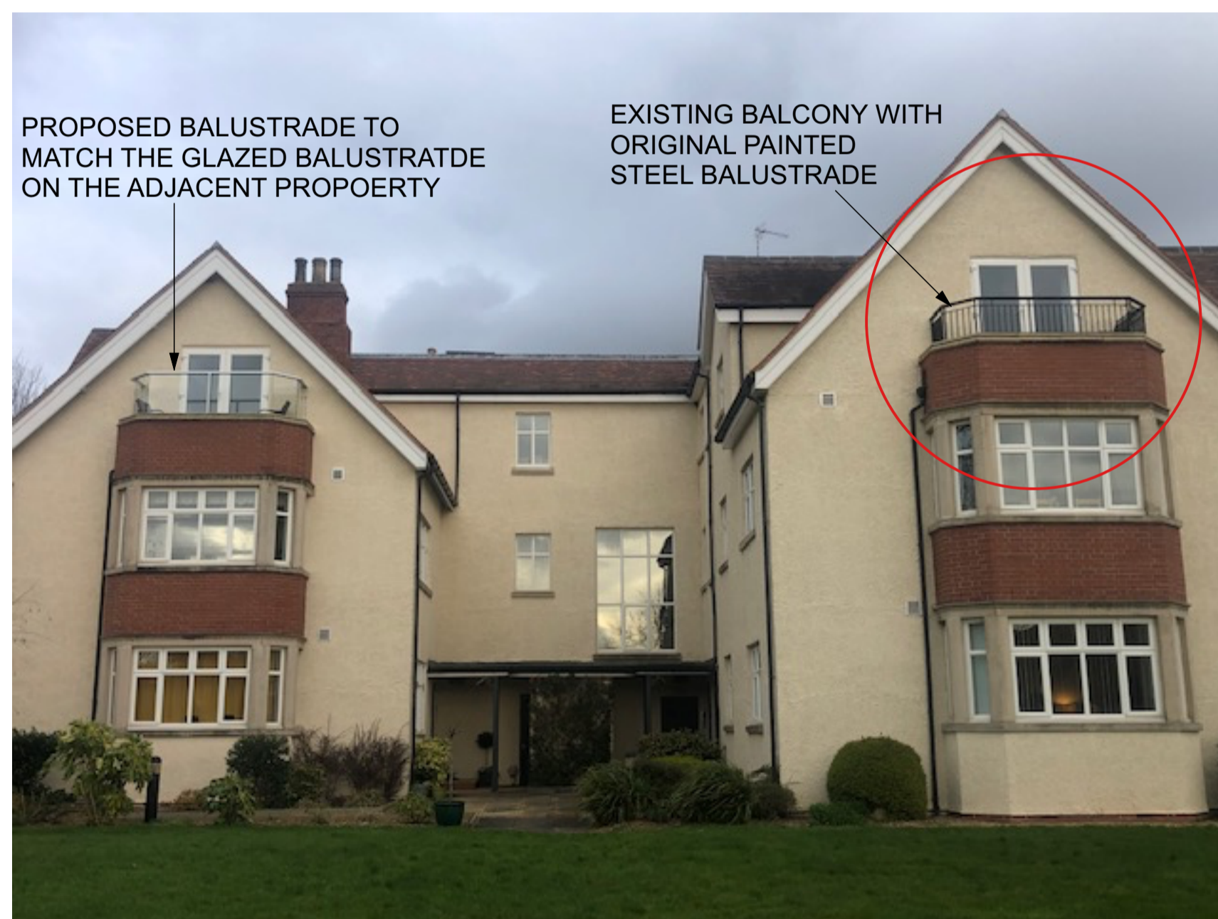
PHOTO OF WEST ELEVATION