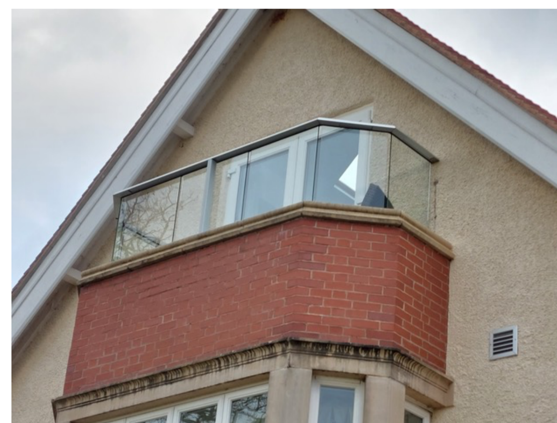
PHOTO OF THE LOOK FOR THE NEW GLAZED BALUSTRADE