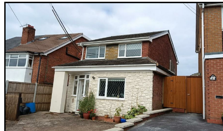
FRONT ELEVATION PHOTOGRAPH