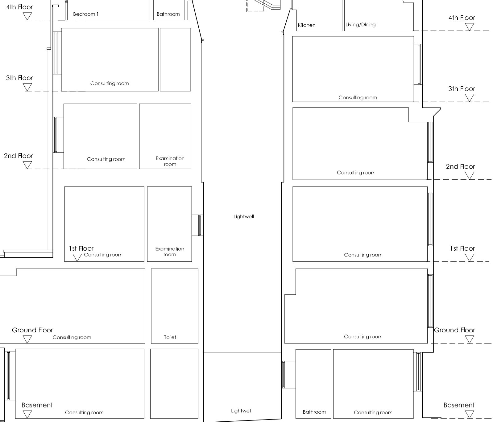
EXISTING SECTION X-X