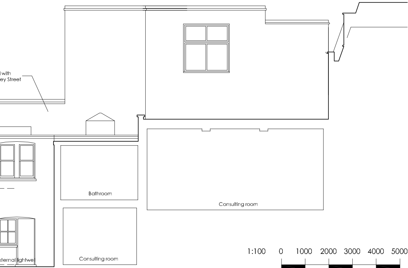
EXISTING SECTION Y-Y