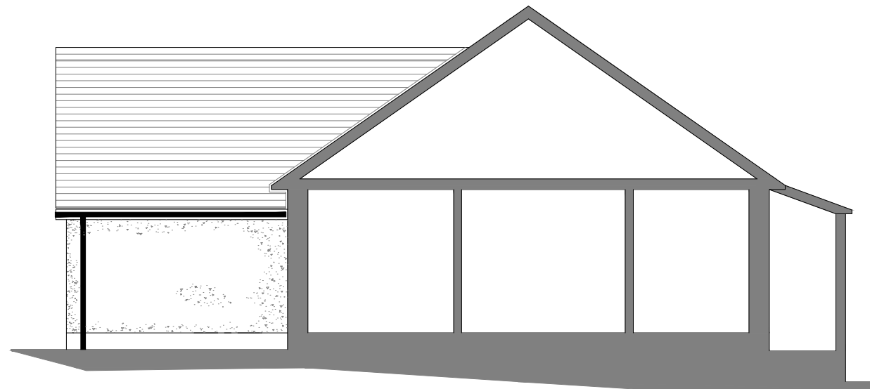
PROPOSED SIDE ELEVATION FACING SOUTH WEST 1 : 1 0 0