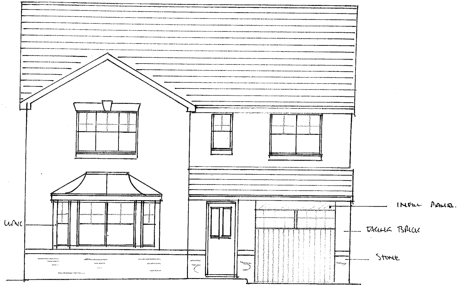
EXISTING FRONT ELEVATION 1:50 @ A3