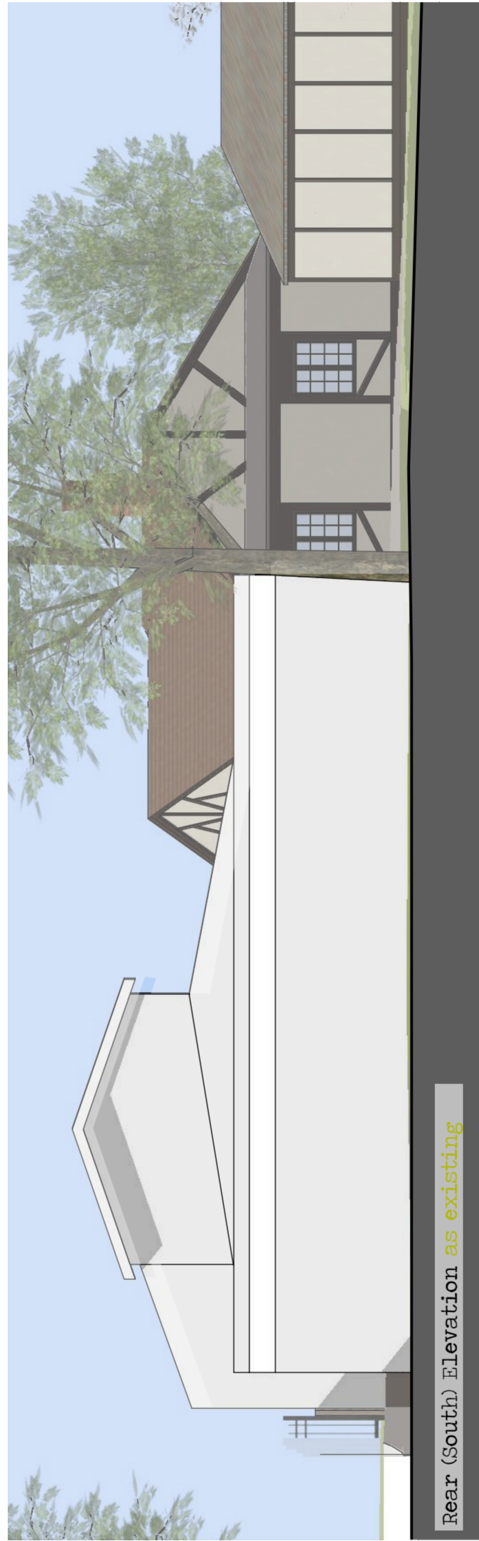
Rear (South) Elevation as existing