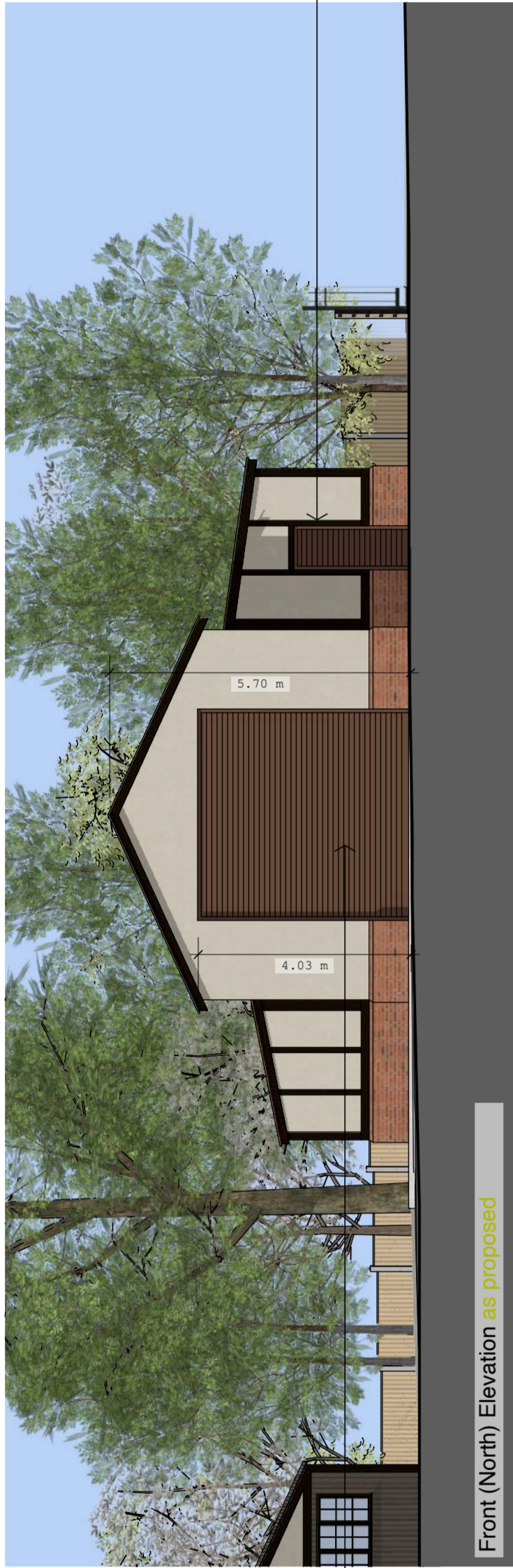
Front (North) Elevation as proposed

Facing brick low level plinth with panelled render finish on carrier board on insulated cladding panels supported by steel portal frame.