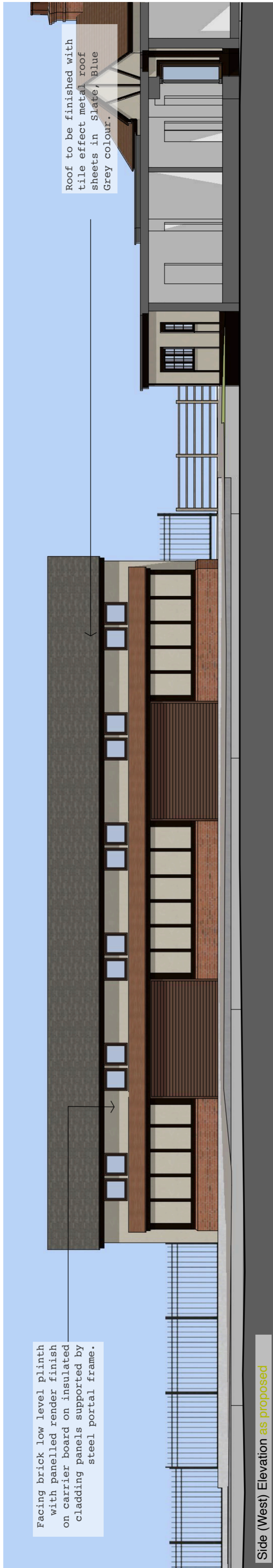
Side (West) Elevation as proposed

Insulated PPC aluminium roller shutter doors.