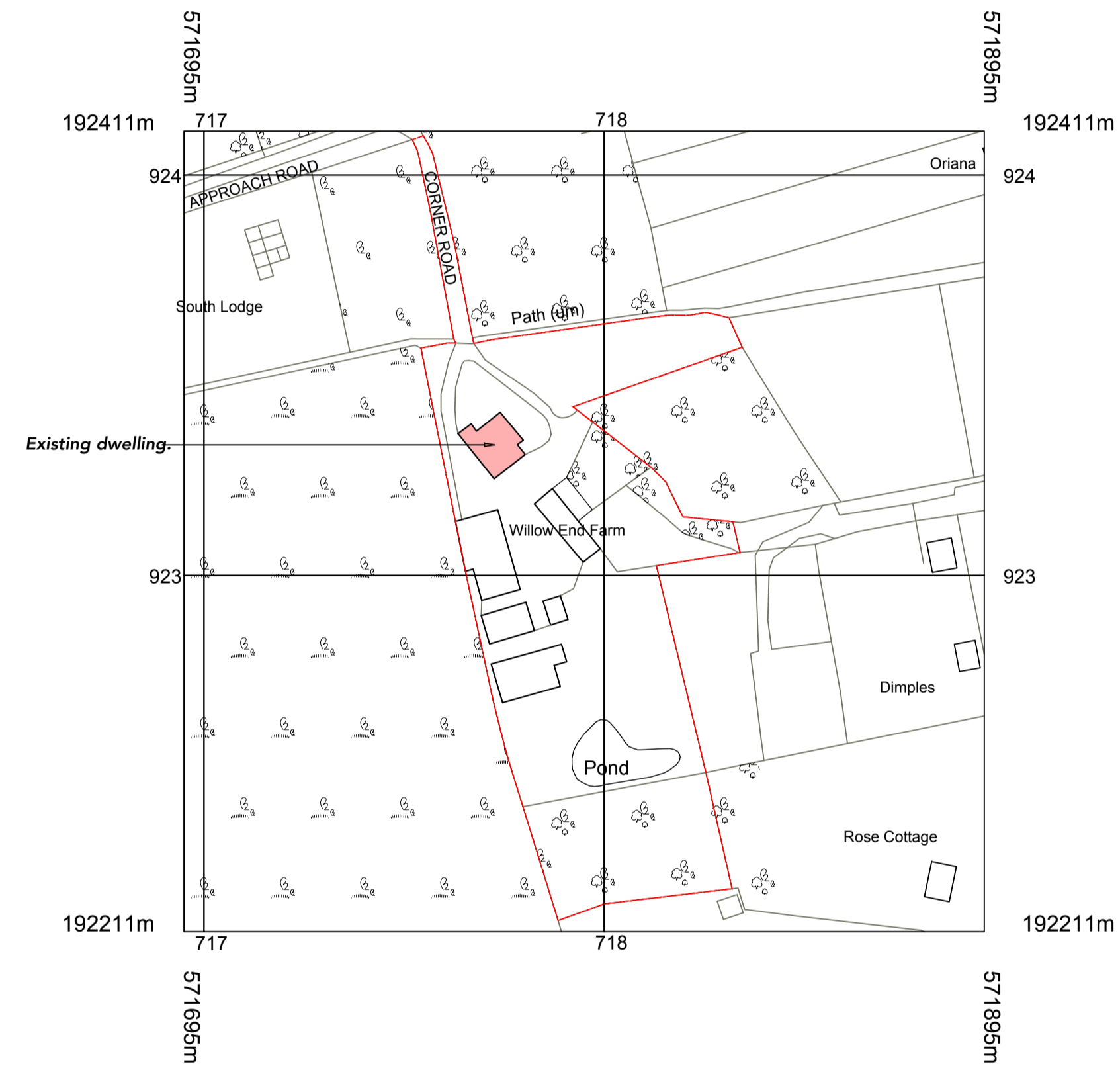
Site Location Scale 1:1250