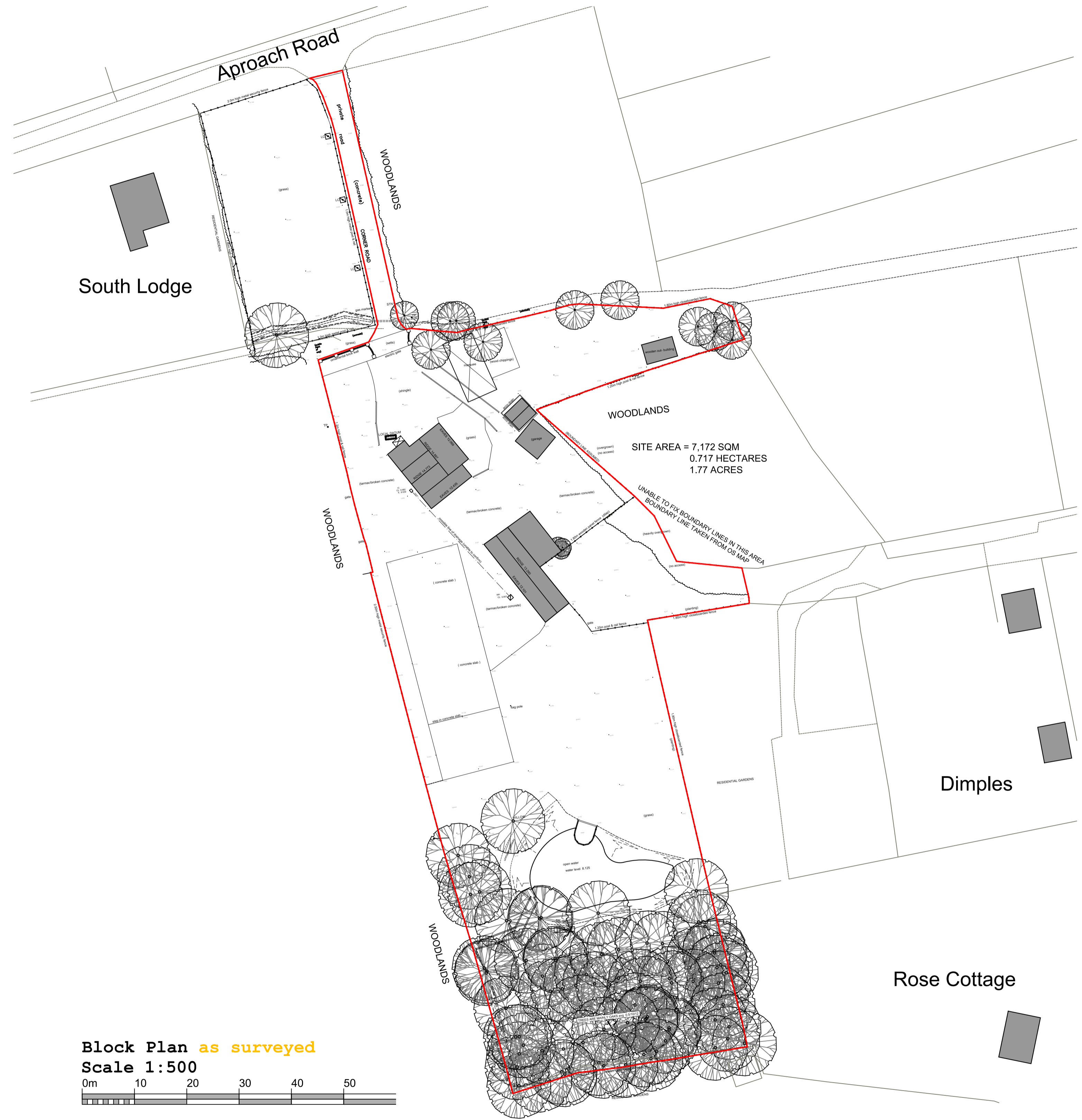
Block Plan as surveyed Scale 1:500