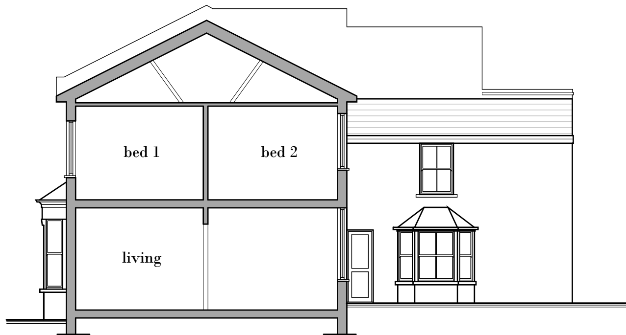
Long Section / Side Elevation