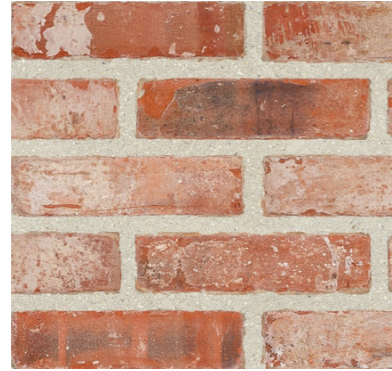
Michelmersh Wirecut red/orange rustic brick