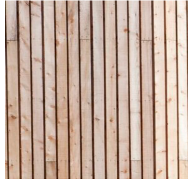
Scotlarch vertical rainscreen cladding