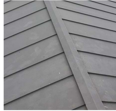
Standing seam zinc roof