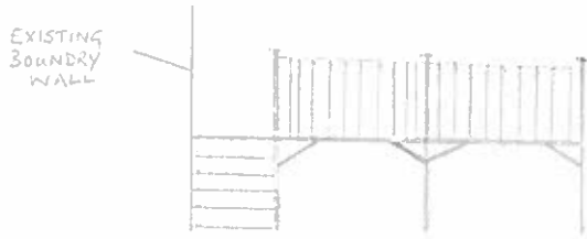
PROPOSED NORTH EAST ELEVATION